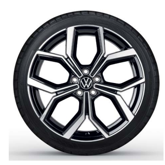
18" Faro Alloy (Optional on GTI)