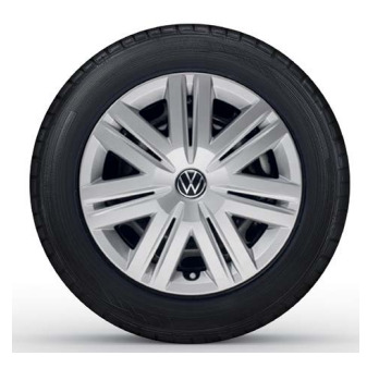
14" steel wheel cover (Standard on Polo)