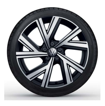
17" Bergamo Alloy (Optional on R-Line)