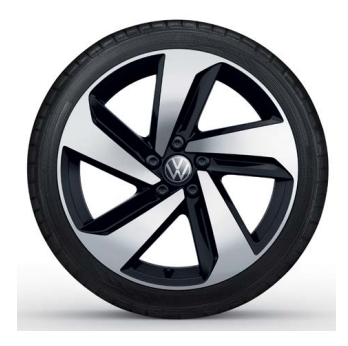
17" Milton Keynes Alloy (Standard on GTI)