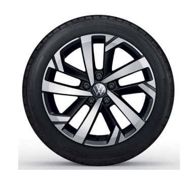
16" Torsby Alloy (Optional on Life)