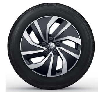
15" Essex Alloy (Optional on Polo, standard on Life)