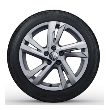
16" Valencia Alloy (Standard on R-Line)