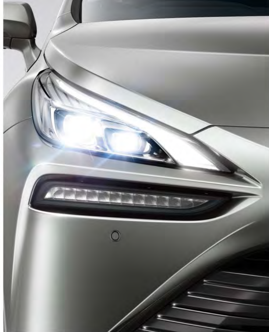
Bi-LED headlights with Adaptive High Beam System enable and disable individual LEDs within each headlamp for precision control.