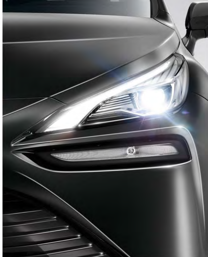
Stylish Bi-LED headlamps including Automatic High Beam light the way safely.