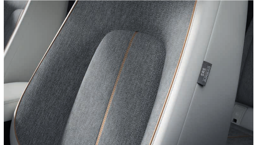
LIGHT GREY CLOTH WITH STONE LEATHERETTE (Available on Sport Lux, First Edition and GT Sport Tech grade)