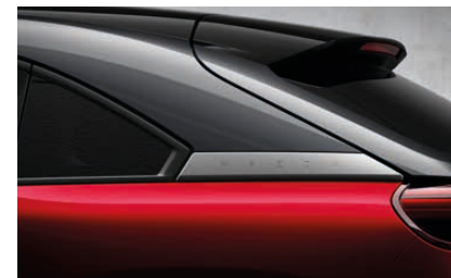
SOUL RED CRYSTAL METALLIC WITH BRILLIANT BLACK ROOF AND DARK GREY METALLIC SIDE PANELS* ^^