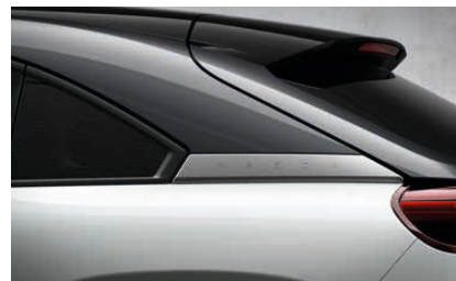
CERAMIC METALLIC WITH BRILLIANT BLACK ROOF AND DARK GREY METALLIC SIDE PANELS* ^^