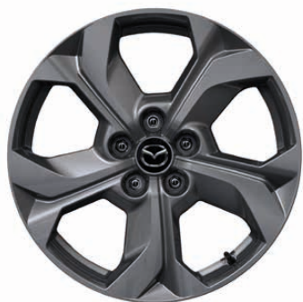
18" Silver Metallic Alloys (Available on SE-L Lux grade)