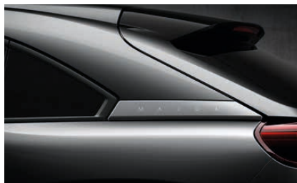
MACHINE GREY METALLIC*