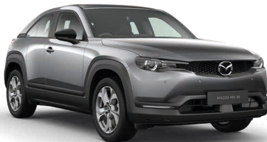
Model shown: All-new Mazda MX-30 SE-L Lux in Machine Grey Metallic paint.