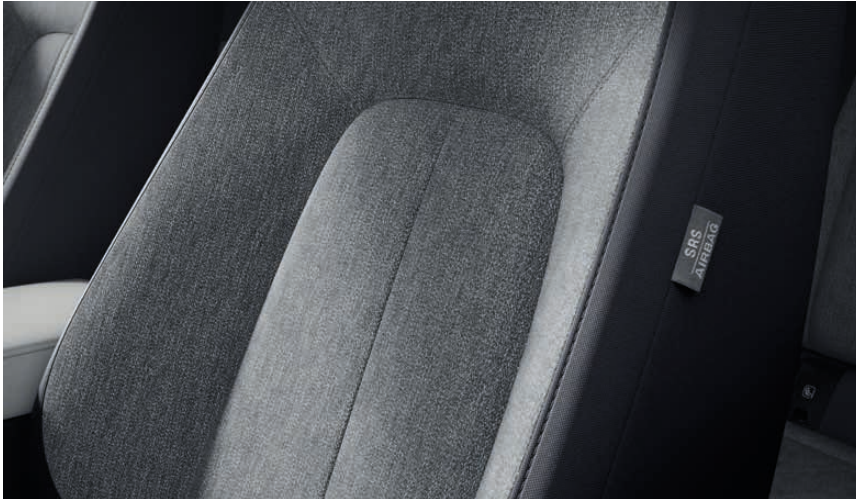
LIGHT GREY CLOTH WITH DARK GREY TRIM (Available on SE-L Lux grade)