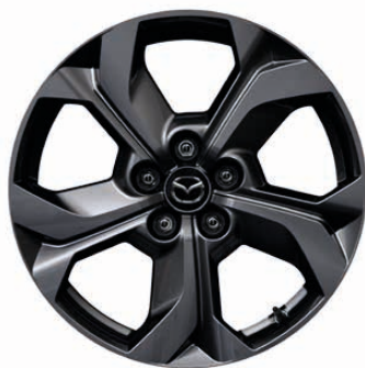
18" Bright Metallic Alloys (Available on Sport Lux, First Edition and GT Sport Tech grades)

*Mica/Metallic/Pearlescent/special paint available at additional cost. ^Polymetal Grey and Ceramic Metallic are free of charge on First Edition models only. ^^Not available on SE-L Lux grade.