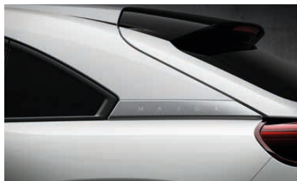
ARCTIC WHITE SOLID