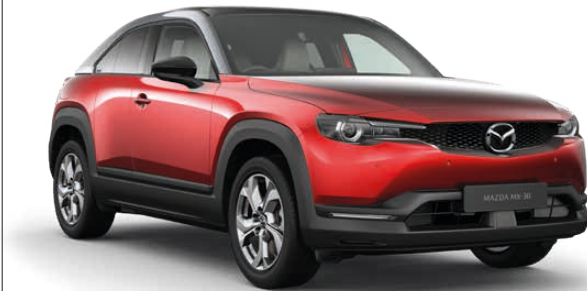
Model shown: All-new Mazda MX-30 GT Sport Tech in Soul Red Crystal Metallic paint with Brilliant Black roof and Dark Grey Metallic side panels.