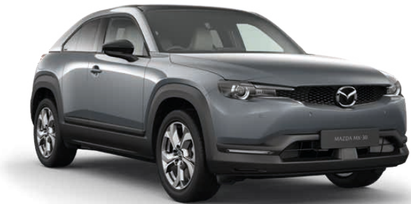
Model shown: All-new Mazda MX-30 Sport Lux in Polymetal Grey Metallic paint with Brilliant Black roof and Silver Metallic side panels.