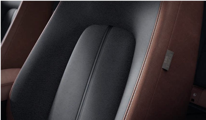
DARK GREY CLOTH WITH BROWN LEATHERETTE (Optional on GT Sport Tech grade)