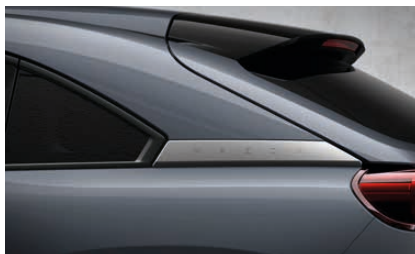
POLYMETAL GREY METALLIC*^