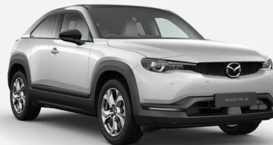
Model shown: All-new Mazda MX-30 First Edition in Ceramic Metallic paint with Brilliant Black roof and Dark Grey Metallic side panels.