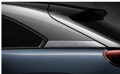
POLYMETAL GREY METALLIC WITH BRILLIANT BLACK ROOF AND SILVER METALLIC SIDE PANELS* ^^