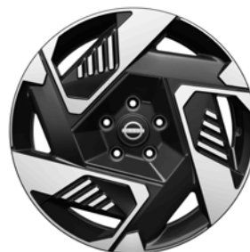
Evolve 18" SPORT alloy wheels