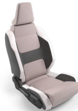
'Chill' – Cream-Grey synthetic leather