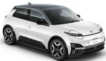
TWO-TONE: PURE WHITE WITH GREY ROOF - YWY