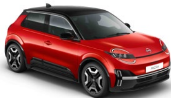
TWO-TONE: REBEL RED WITH BLACK ROOF - YZA