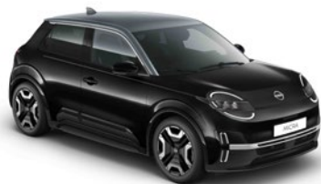
TWO-TONE: MYSTERY BLACK WITH GREY ROOF - YWX