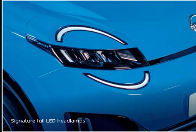
Signature full LED headlamps