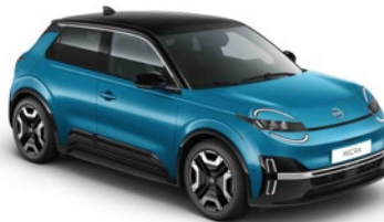
TWO-TONE: AUTHENTIC BLUE WITH BLACK ROOF - YZF