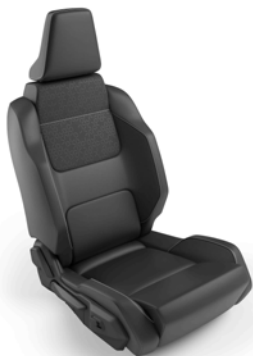
'Modern' – Black cloth