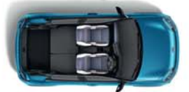
UP TO 1106L BOOT SPACE WITH FOLDED SEATS