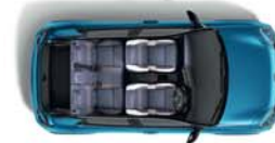
UP TO 326L BOOT SPACE