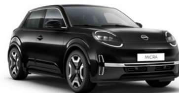
MYSTERY BLACK - GNE