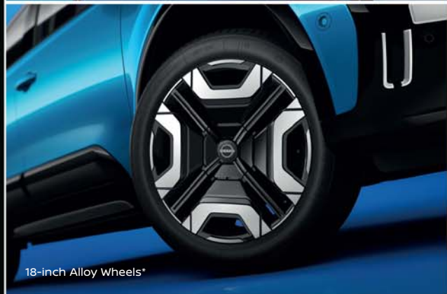
18-inch Alloy Wheels*