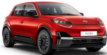
REBEL RED - NPT