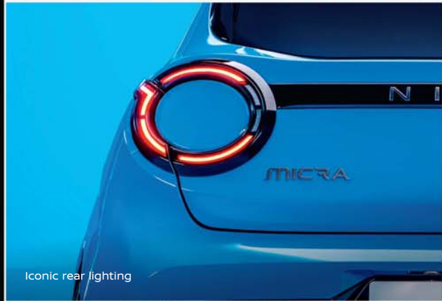
Iconic rear lighting