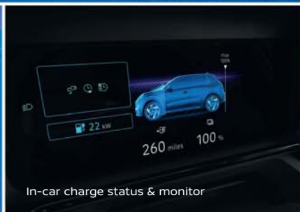
In-car charge status & monitor