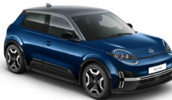
TWO-TONE: NOBEL MARINE WITH GREY ROOF - YWZ