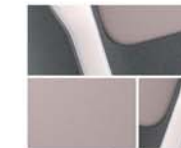
CHILL (OPTIONAL ON EVOLVE)