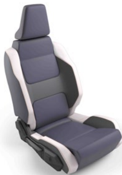
'Audacious' – Blue synthetic leather