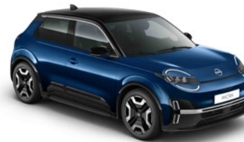
TWO-TONE: NOBEL MARINE WITH BLACK ROOF - YWW