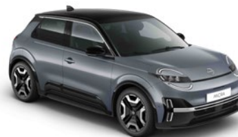
TWO-TONE: ELEGANT SILVER WITH BLACK ROOF - YUY