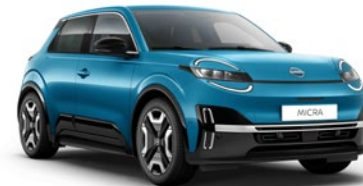
AUTHENTIC BLUE - RCN