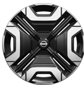
Advance 18" ICONIC alloy wheels