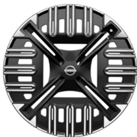
Engage 18" ACTIVE structured wheels