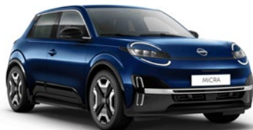
NOBLE MARINE - RRE