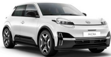
PURE WHITE - 369