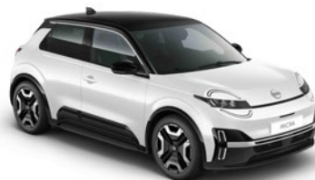
TWO-TONE: PURE WHITE WITH BLACK ROOF - XUF