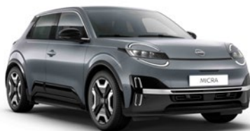
ELEGANT SILVER - KQG