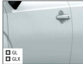
Arctic White Pearl