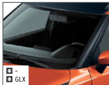
Lucent Orange & Midnight Black