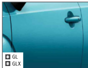
Turquoise Blue Pearl Metallic