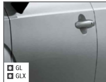
Glistening Grey Metallic