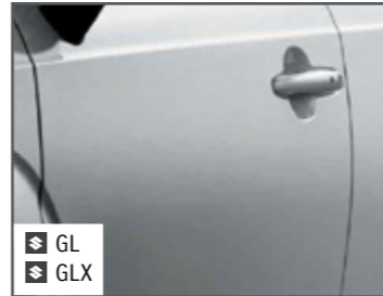
Silky Silver Metallic