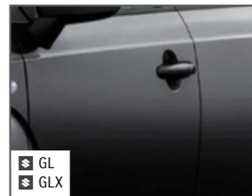
Midnight Black Pearl Limited