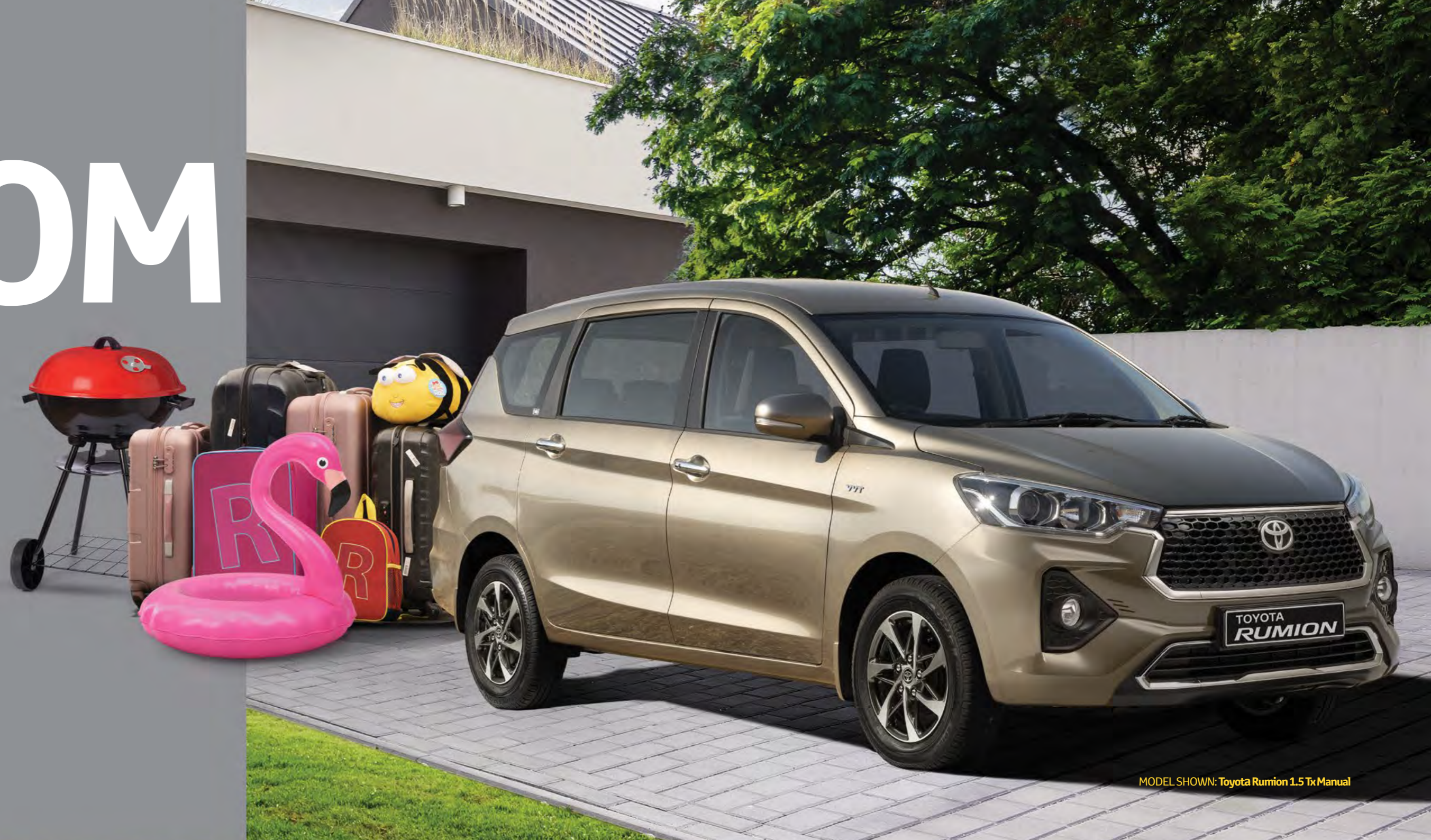
MODEL SHOWN: Toyota Rumion 1.5 Tx Manual