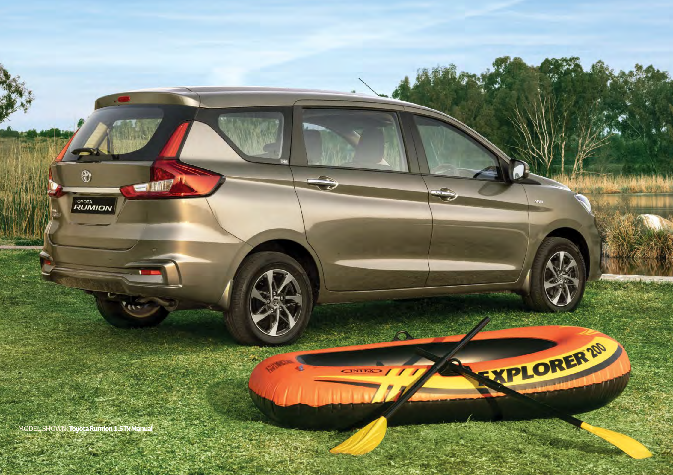
MODEL SHOWN: Toyota Rumion 1.5 Tx Manual