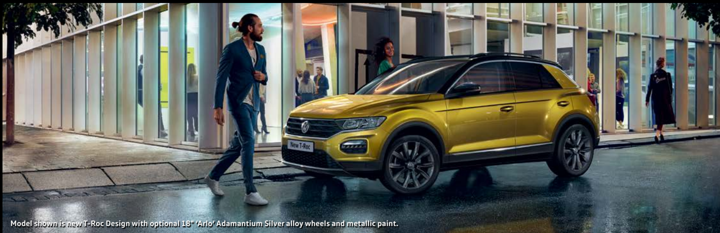
Model shown is new T-Roc Design with optional 18" "Arlo" Adamantium Silver alloy wheels and metallic paint.

2 The BIK % figure quoted includes the 4% diesel supplement, which is effective as of 6.4.2018, where applicable. Please note: the increase in VED and BIK rate that is payable is in addition to the cost of the optional alloy wheels. Please consult your Volkswagen retailer for full details.