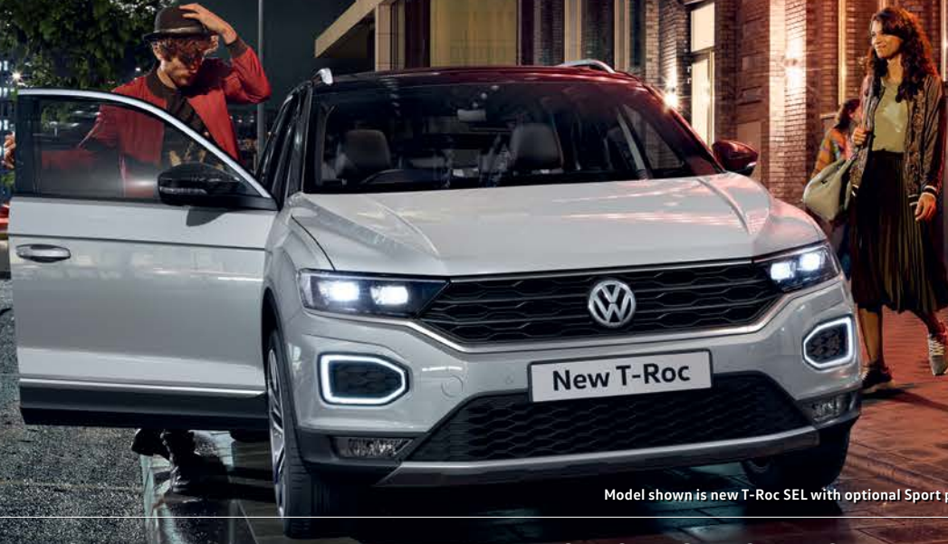
Model shown is new T-Roc SEL with optional Sport pack, two-tone black roof and metallic paint.