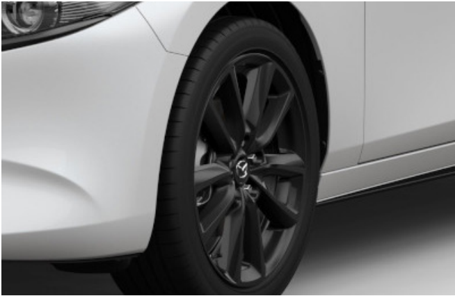
18" Alloy Wheel in Black Metallic*