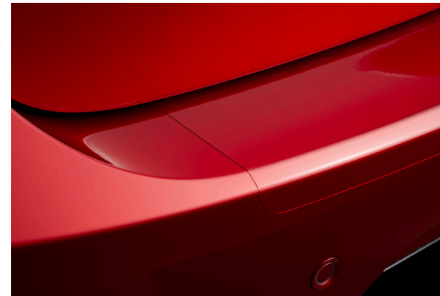
Clear Rear Bumper Protection Strip

*Not compatible with the Design Pack or Front, Side and Rear Airdam Skirt