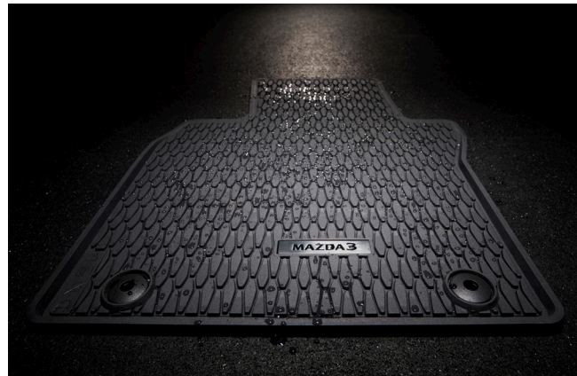
100% Recycled All Weather Mats