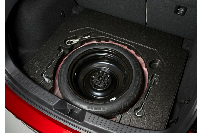
Space Saver Spare Wheel Kit