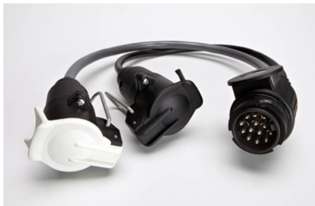
Adapter 13 Pins to 7**