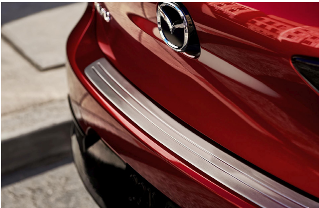
Stainless Steel Rear Bumper Step Plate**