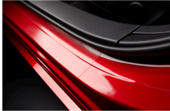
Door Sill Protection Slip