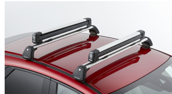
Thule Ski & Snowboard Attachment