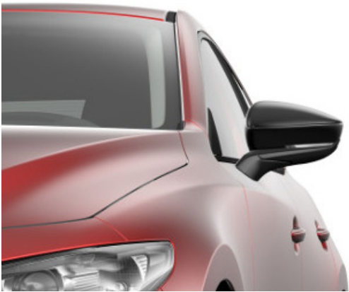
Door Mirror Cover - Black