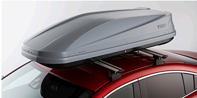
Thule Roof Box - Long Type