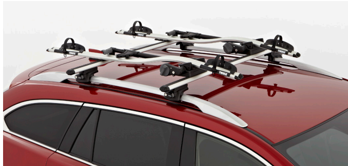
Thule Pro Bicycle Roof Bar Attachment