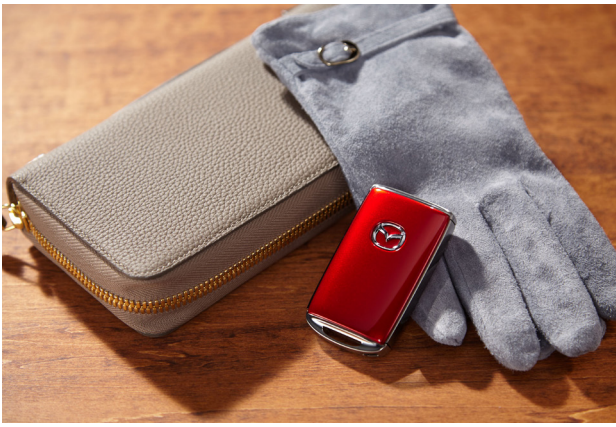
Key Cover (Various Colours)