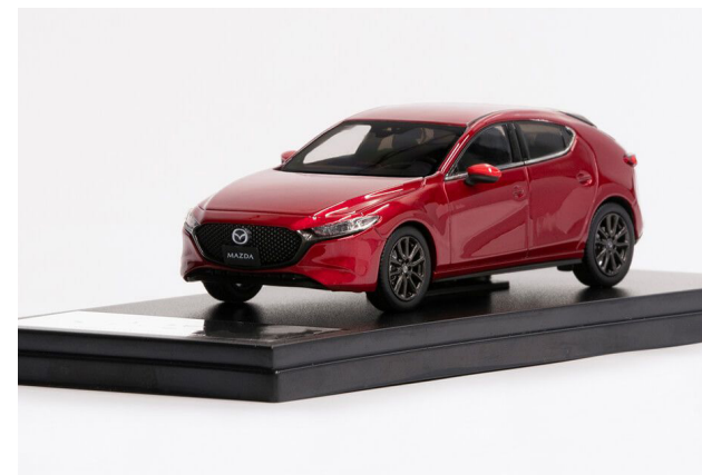
Mazda 3 Model Car