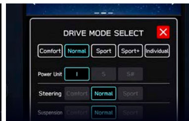
5 driving modes