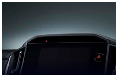
Driver Monitoring System