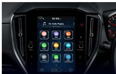
11,6" infotainment touch screen

Be the master of your own universe thanks to the tablet-like 11,6" infotainment touch screen with lightning-fast response and crystal clear, high-definition graphics. Tap into your contacts, send messages, bring up maps, select different driving modes, adjust the dual zone air-conditioning system and access compatible apps, news, music, podcasts and more. This advanced, multi-function infotainment control centre can be controlled with the mere power of your voice or the flick of a finger.