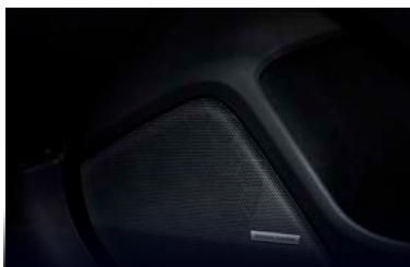
10 Harman Kardon® speakers, subwoofer and amplifier