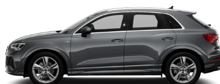
Daytona Grey Pearl Effect 6Y6Y €898