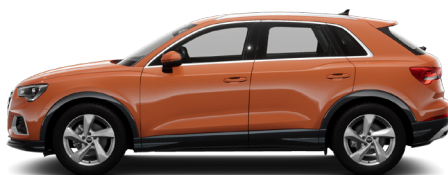
Pulse Orange Solid M9M9 €443