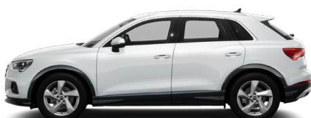
Glacier White Metallic 2Y2Y €898