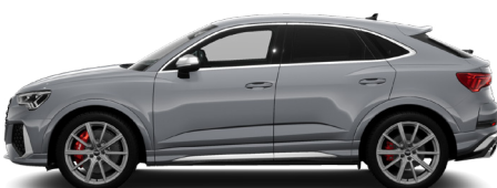
Nardo Grey Solid 6Y6Y 1 €1,349