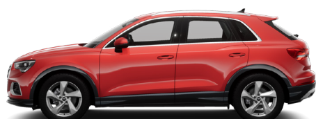
Tango Red Metallic Y1Y1 €898