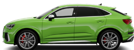
Kyalami green Solid 7R7R 1 €1,349