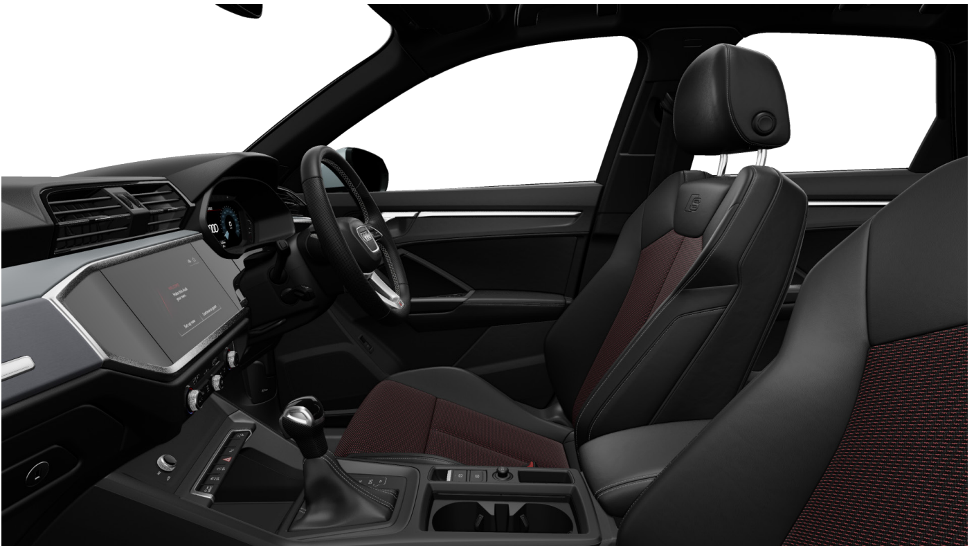
Black-Red/Black “Pulse” Cloth/mono.pur 550 Artificial Leather Combination Interior (Option Code GK)