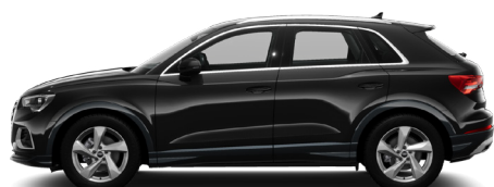
Mythos Black Metallic 0E0E €898