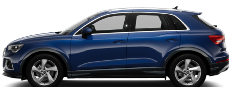
Navarra Blue Metallic 2D2D €898