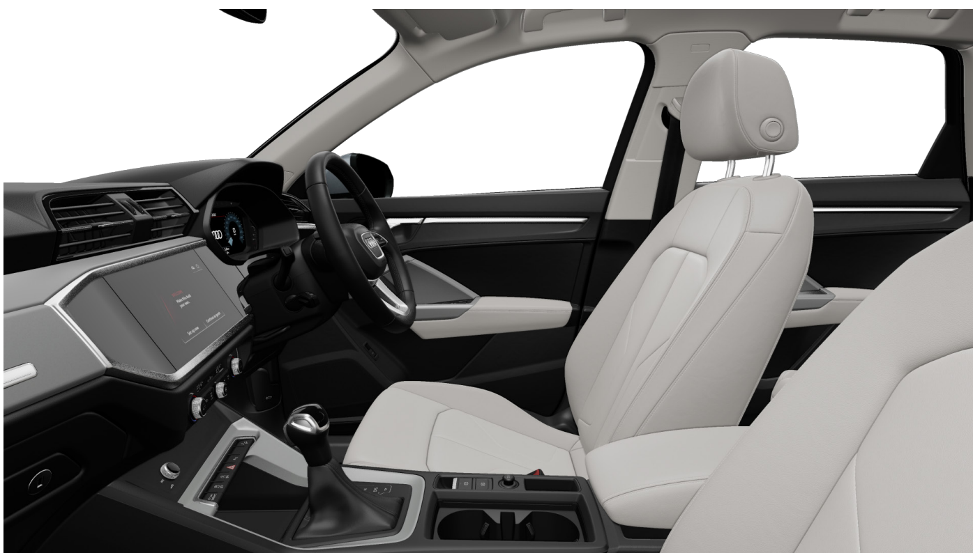
Beige/Black Leather Interior (Option Code GC)