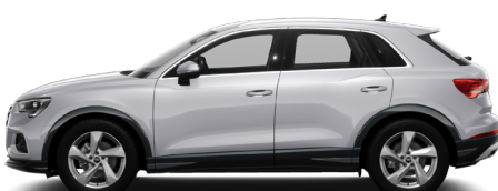
Floret Silver Metallic L5L5 3 €898