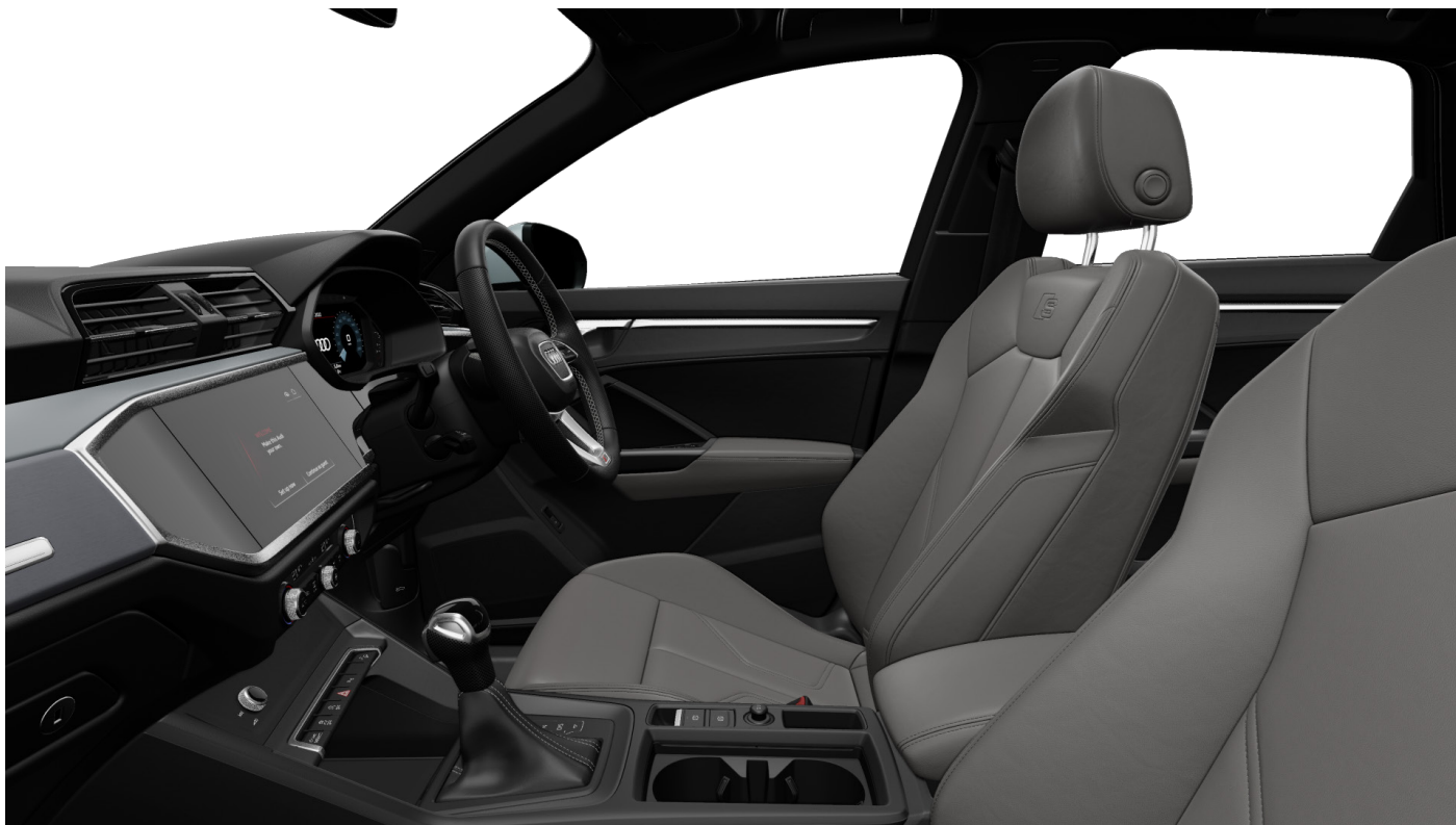
Rotor Grey/Black Leather Interior (Option Code OQ)