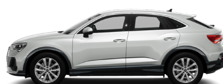
Dew Silver Metallic N8N8 2 €898