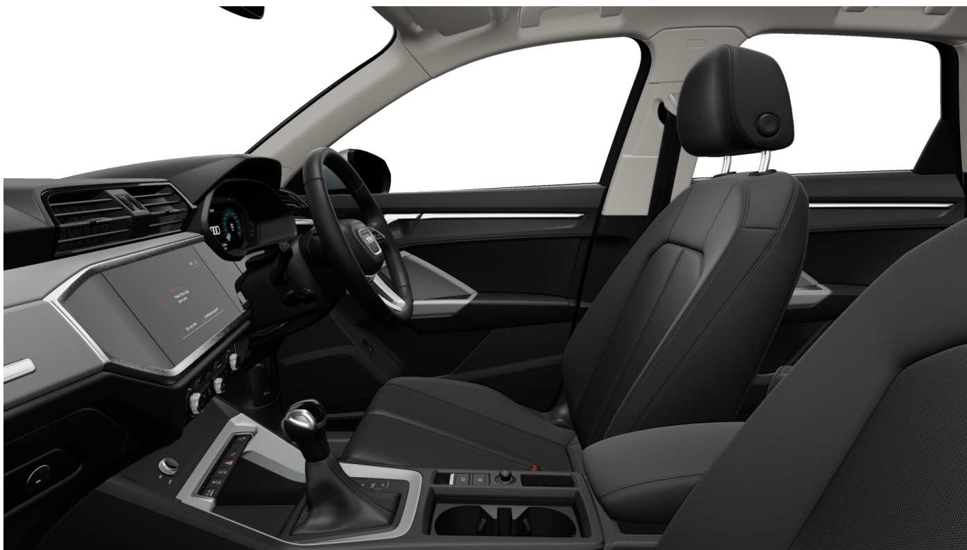
Black/Black Cloth Interior (Option Code FZ)