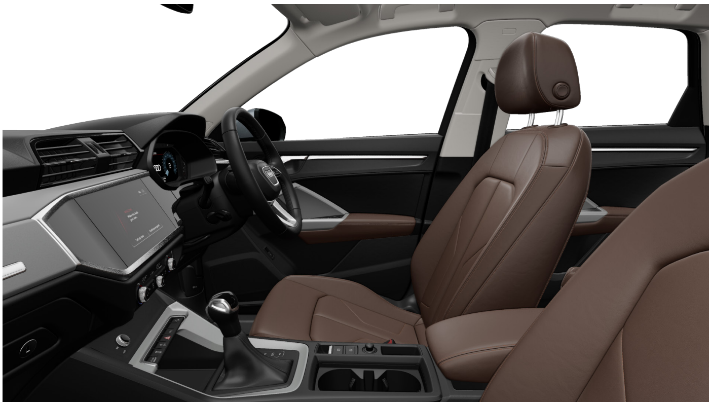
Okapi Brown/Black Leather Interior (Option Code ML)