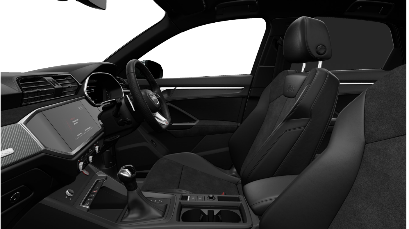
Black/Black Leather Interior (Option Code QH)