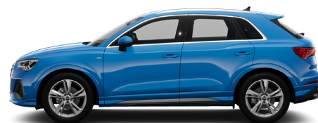
Turbo Blue Solid N6N6 €443