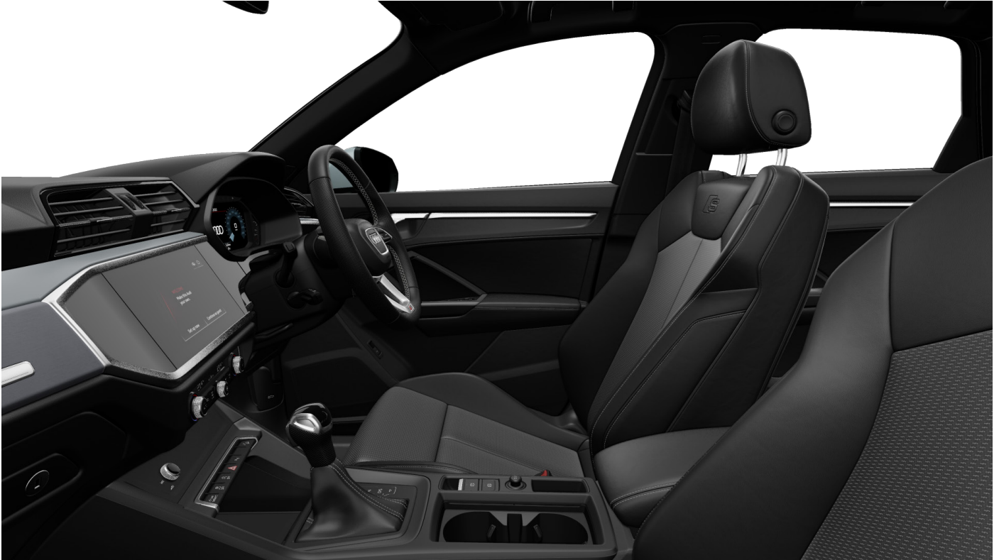
Black/Black “Pulse” Cloth/mono.pur 550 Artificial Leather Combination Interior (Option Code EI)