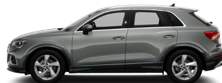
Chronos Grey Metallic Z7Z7 €898