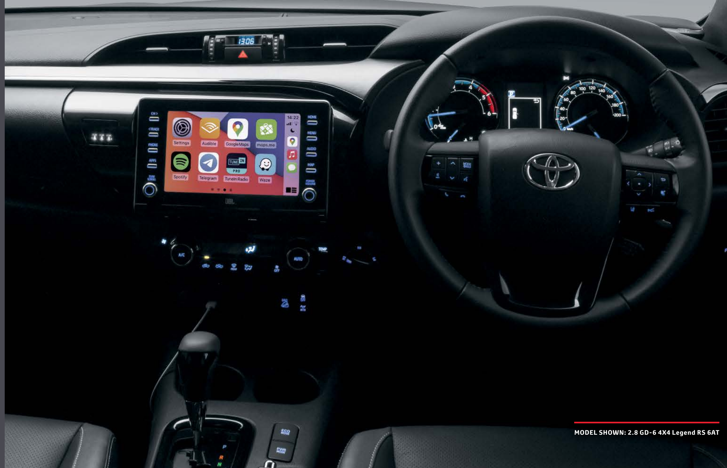
MODEL SHOWN: 2.8 GD-6 4X4 Legend RS 6AT

Additional ease of access is attained through the fitment of Smart Entry* and a Push Start button*, whereby the vehicle can be locked or unlocked and started without the key fob being removed from the driver's pocket.