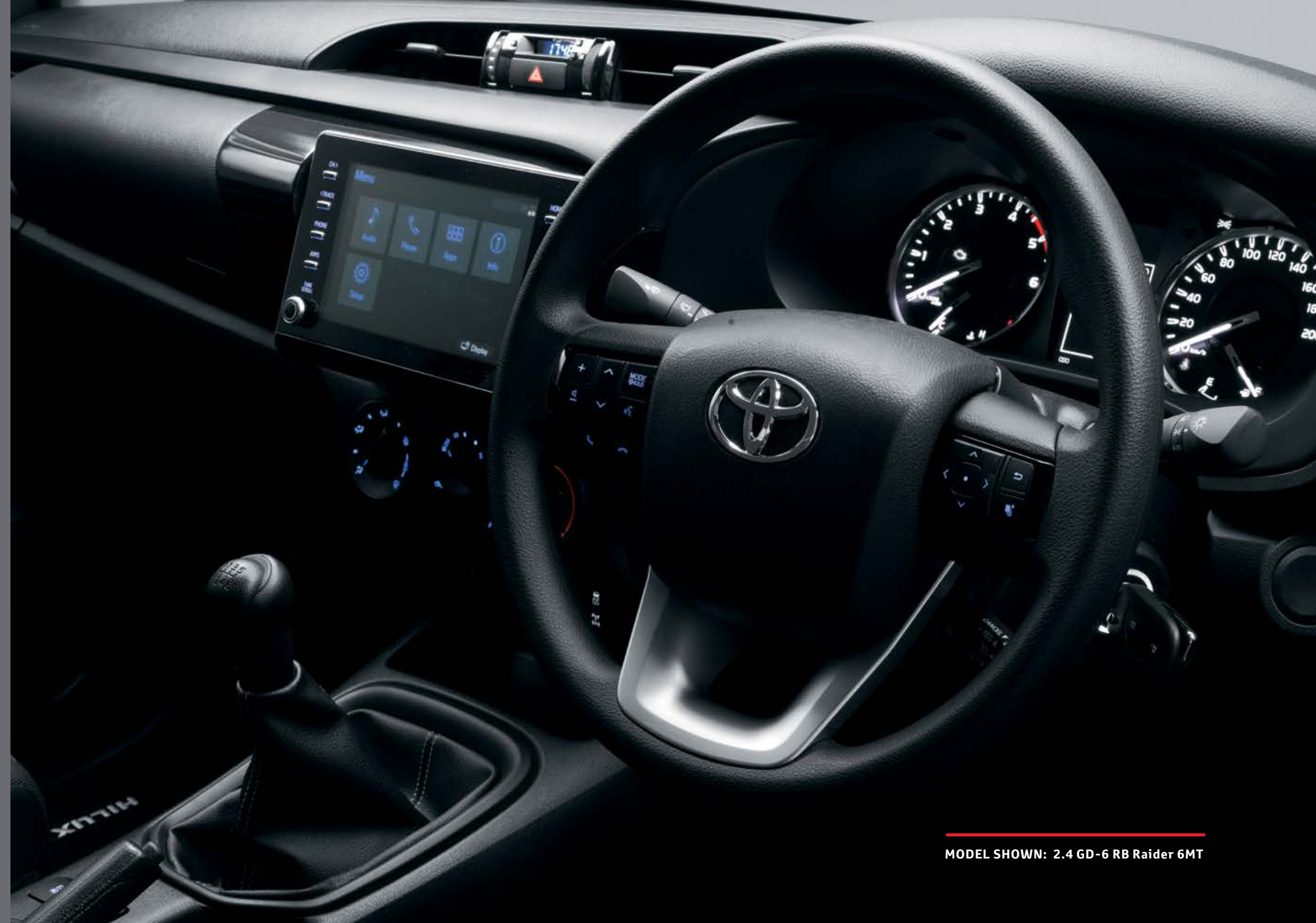
MODEL SHOWN: 2.4 GD-6 RB Raider 6MT