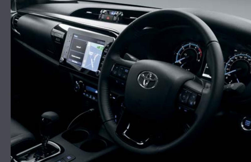
LEATHER-CLAD STEERING WHEEL*