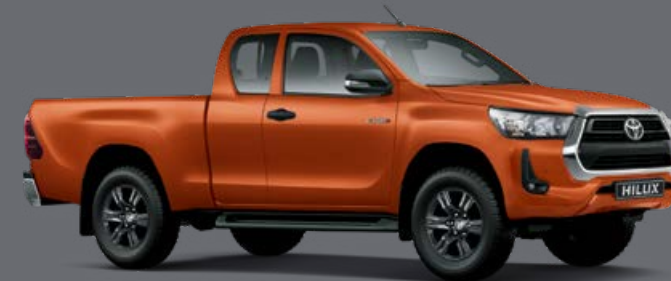
MODEL SHOWN: HILUX 2.4GD-6 RB Raider 6AT

Raider models are fitted with comfortable black fabric seats.