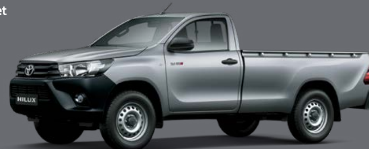
MODEL SHOWN: HILUX 2.4 GD-6 RB SR 6MT

Drivers can look forward to one-touch driver* electric window operation, and air conditioner*.