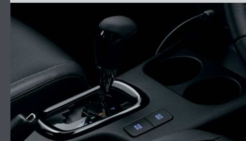
LEATHER-CLAD GEAR SELECTOR*