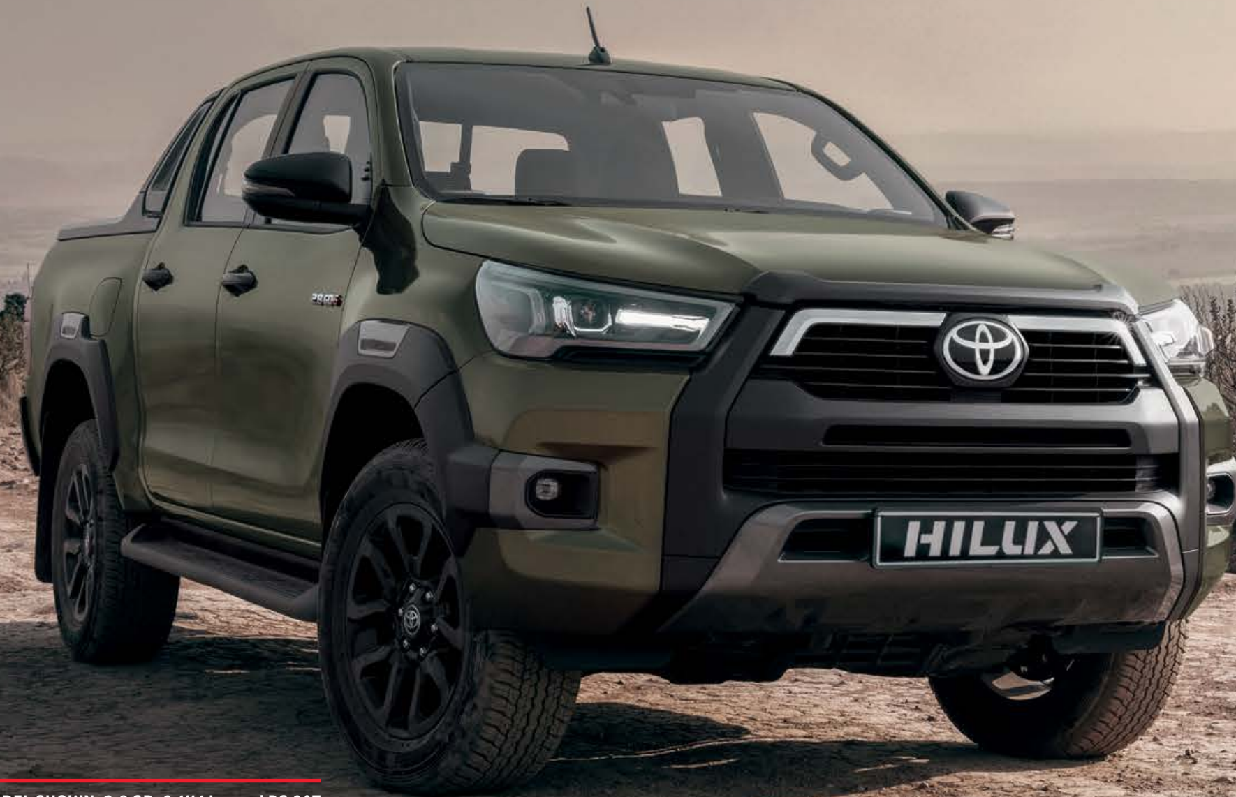
MODEL SHOWN: 2.8 GD-6 4X4 Legend RS 6AT