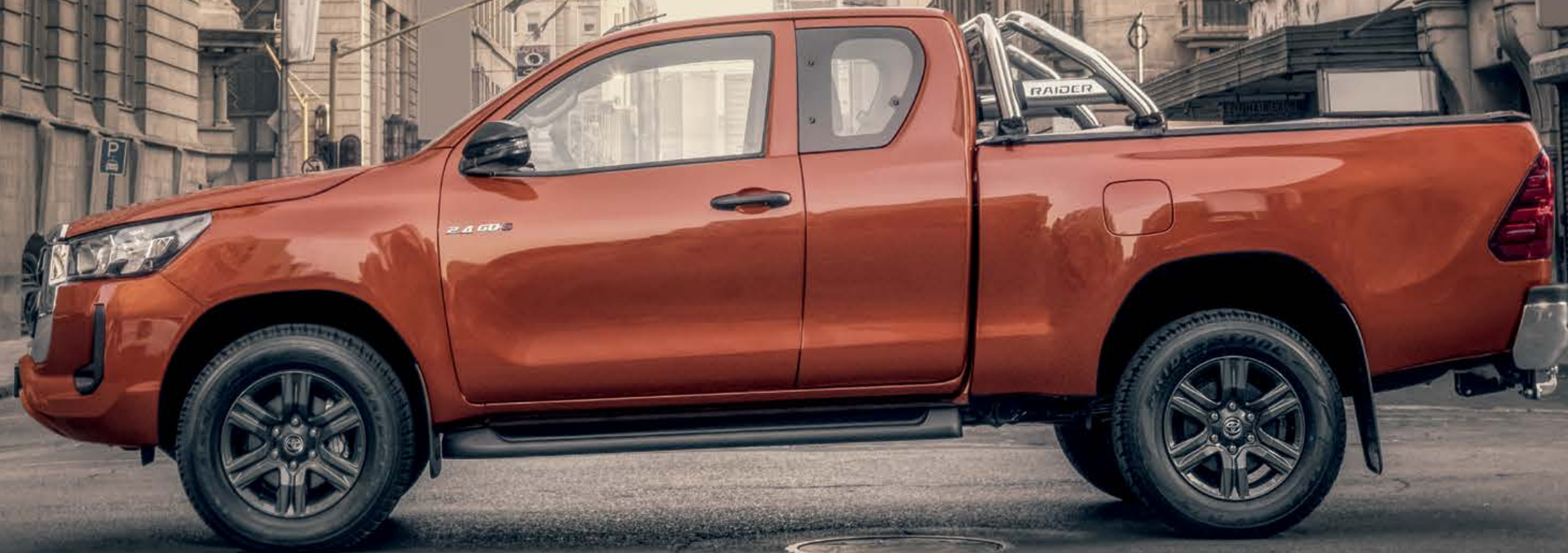
MODEL SHOWN: 2.8 GD-6 4X4 Legend RS 6AT

ALL MODELS ARE EQUIPPED WITH ADVANCED BRAKE CONTROL SYSTEMS TO HELP PREVENT ACCIDENTS OR MITIGATE INJURY. THESE INCLUDE: