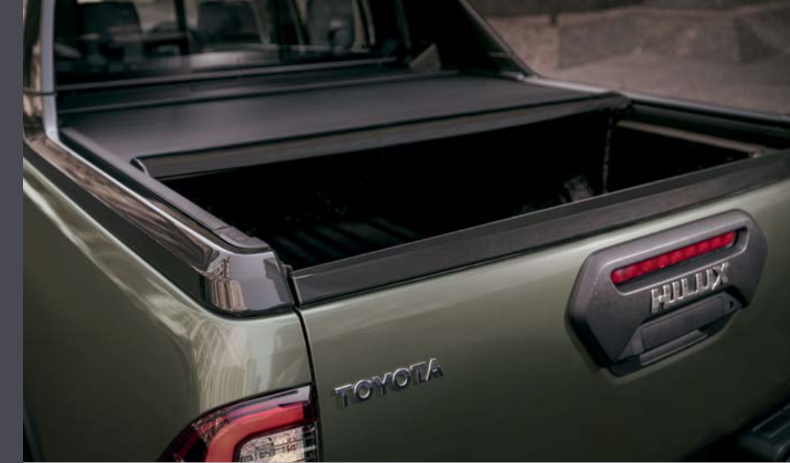
AUTOMATIC TONNEAU ROLLER SHUTTER*