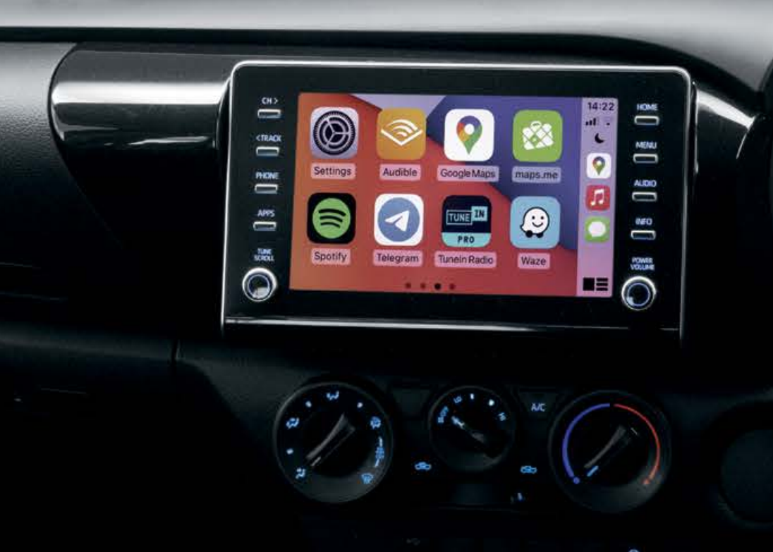
RAIDER: TOUCH SCREEN DISPLAY AUDIO