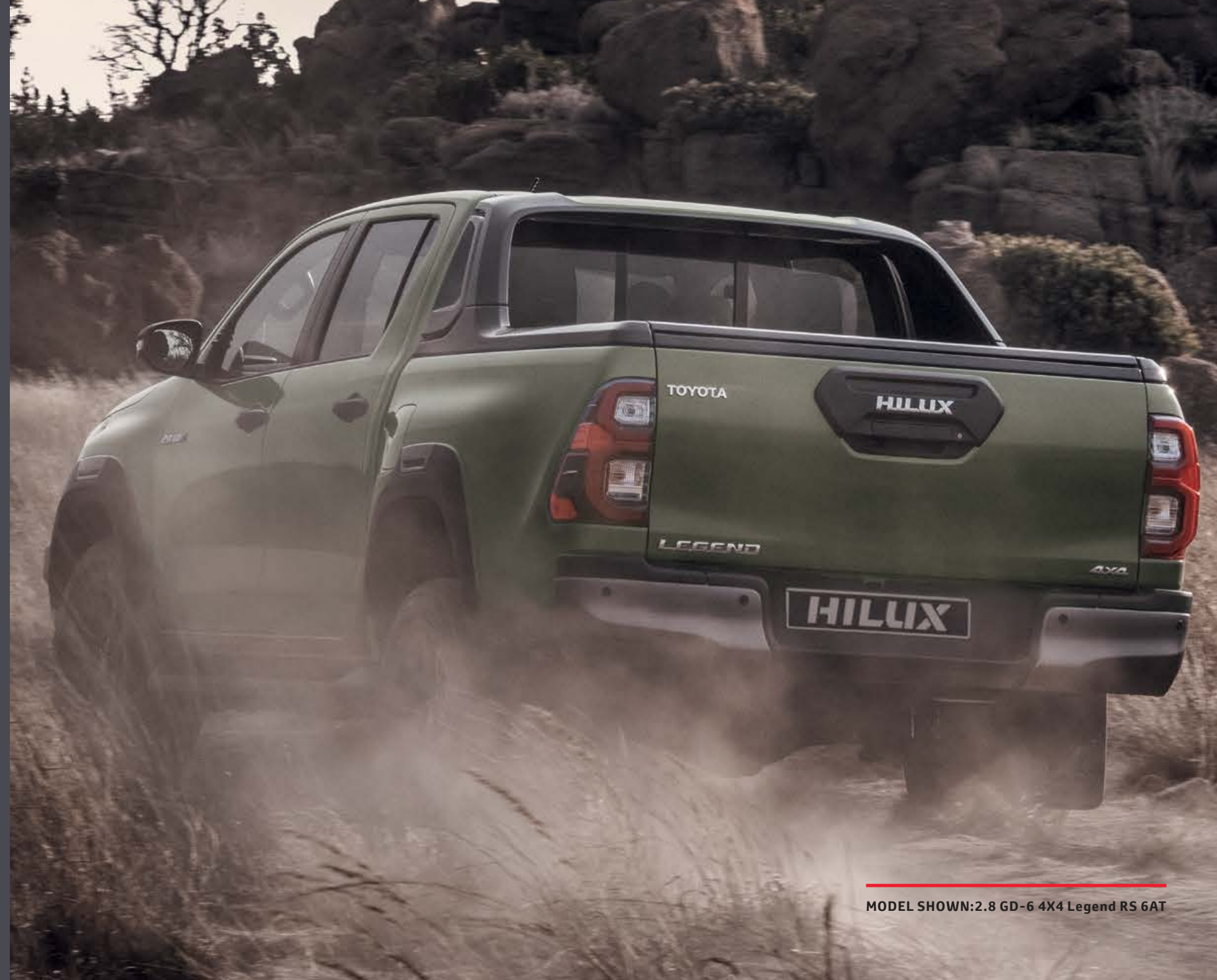
MODEL SHOWN: 2.8 GD-6 4X4 Legend RS 6AT

LEGENDARY TOUGHNESS REQUIRES LEGENDARY POWER. HELPING YOU WELCOME ANY CHALLENGE IS A RANGE OF PETROL, TURBODIESEL AND 48V ENGINES, FITTED WITH EITHER 5-SPEED OR 6-SPEED MANUAL OR 6-SPEED AUTOMATIC TRANSMISSIONS.