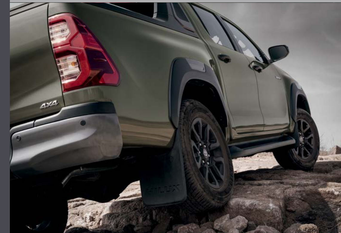
LEGEND BLACK ACCENTS