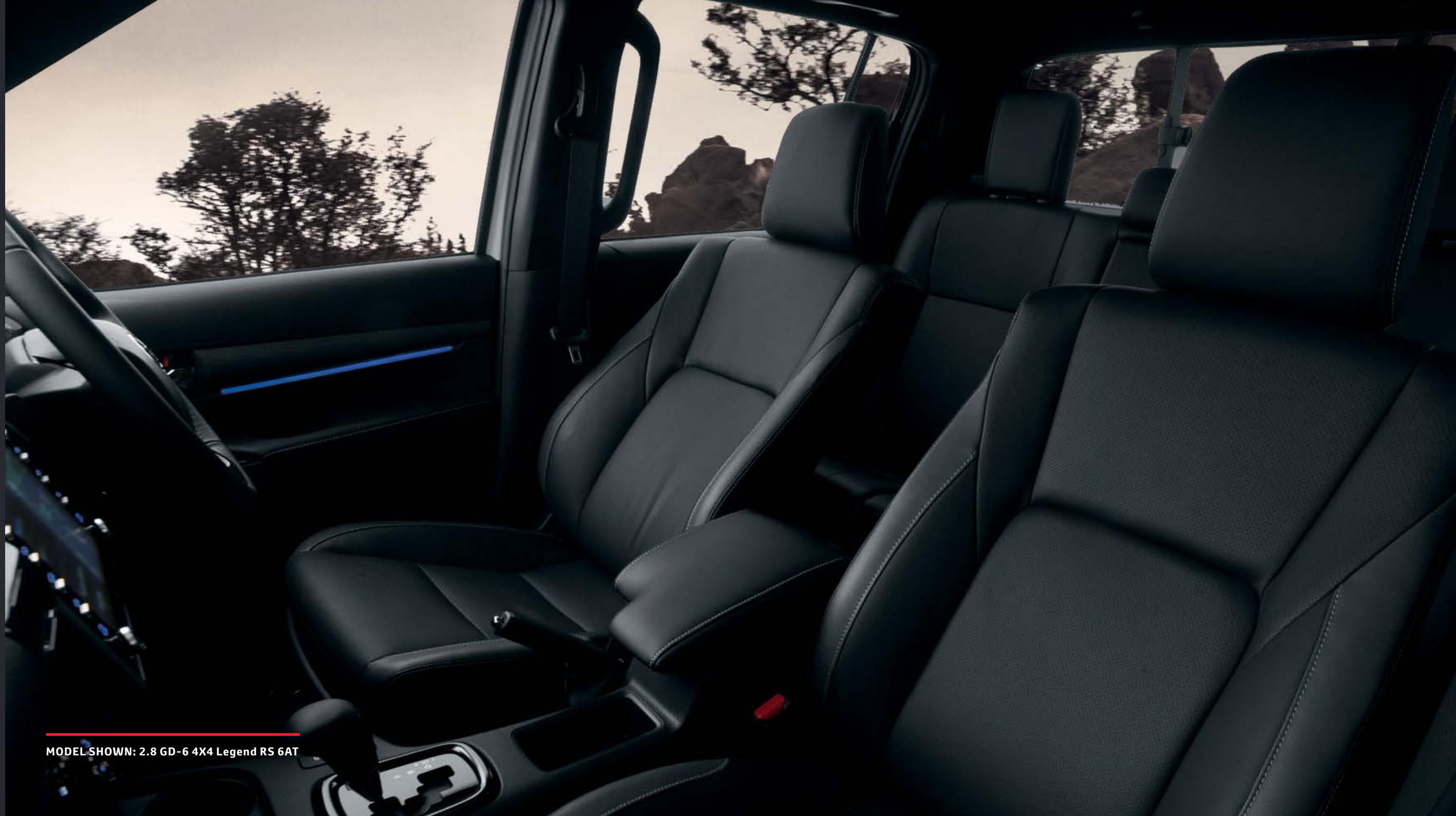
MODEL SHOWN: 2.8 GD-6 4X4 Legend RS 6AT