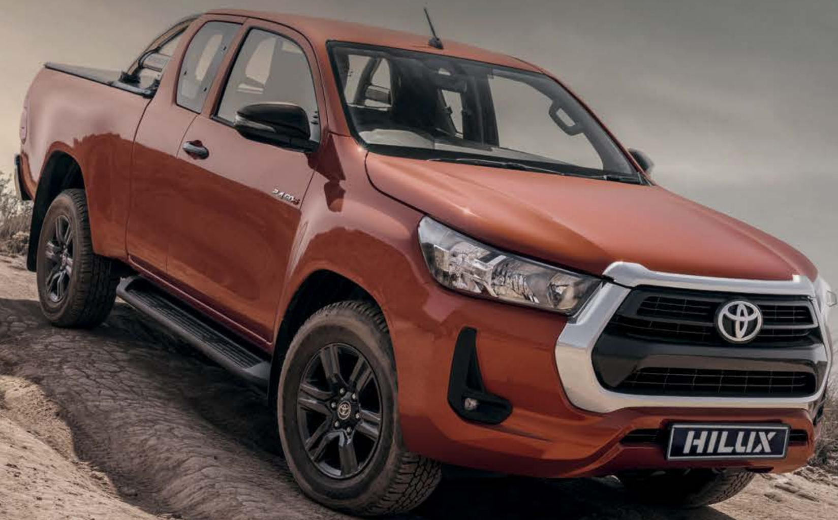
MODEL SHOWN: 2.4 GD-6 Raised Body Raider 6AT