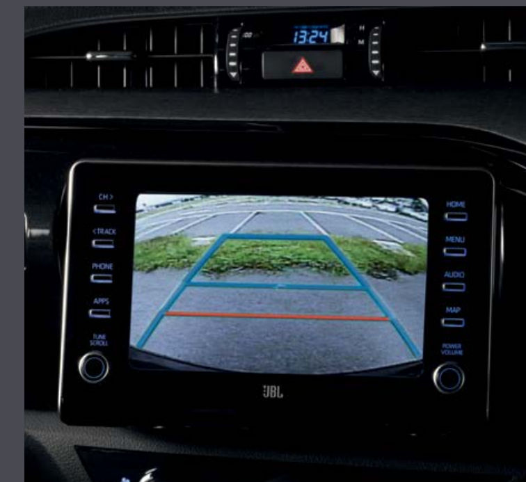
REVERSE CAMERA DISPLAY*