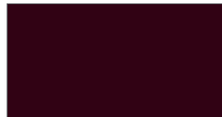
SIREN RED TINTCOAT