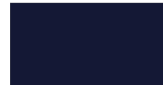
BLUE VELVET METALLIC