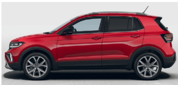
Kings Red Metallic *