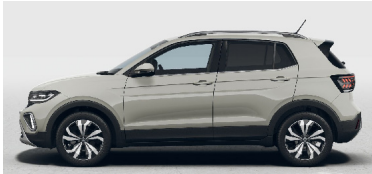
Ascot Grey Solid *