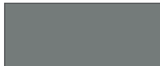
SATIN STEEL GRAY METALLIC 1