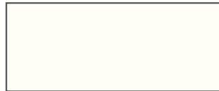
IRIDESCENT PEARL TRICOAT 1