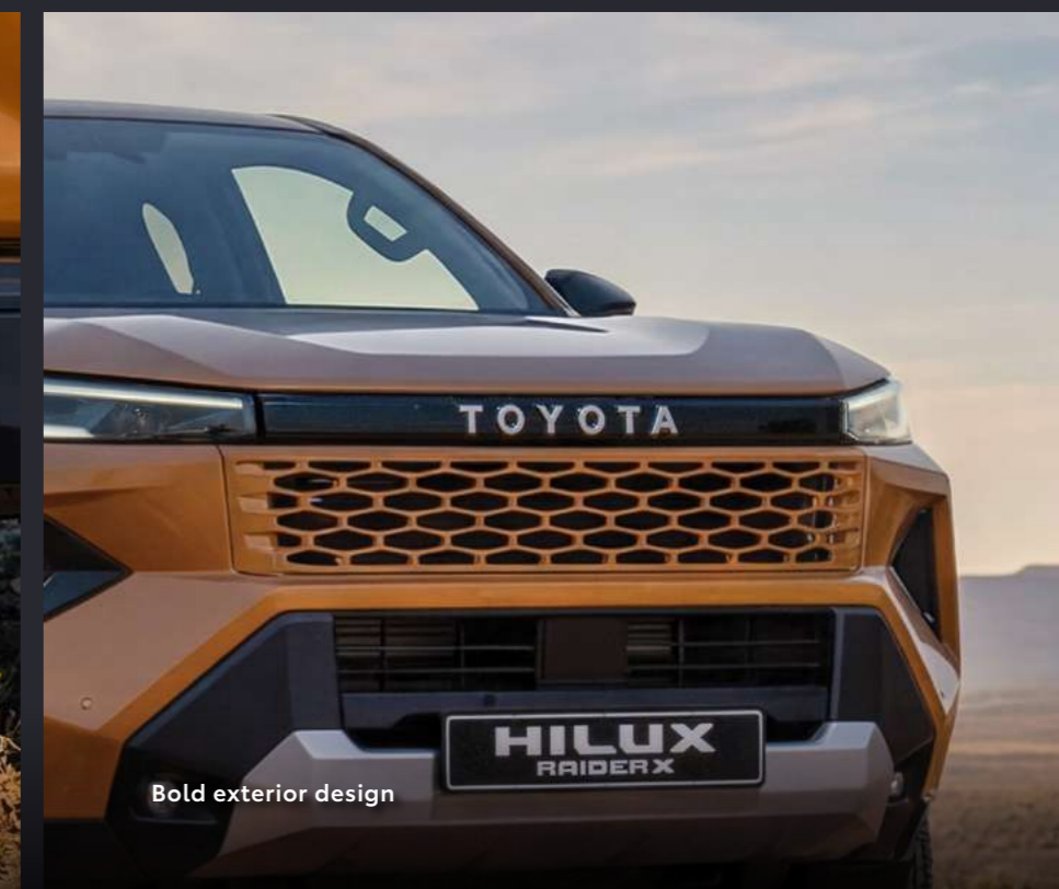
Bold exterior design