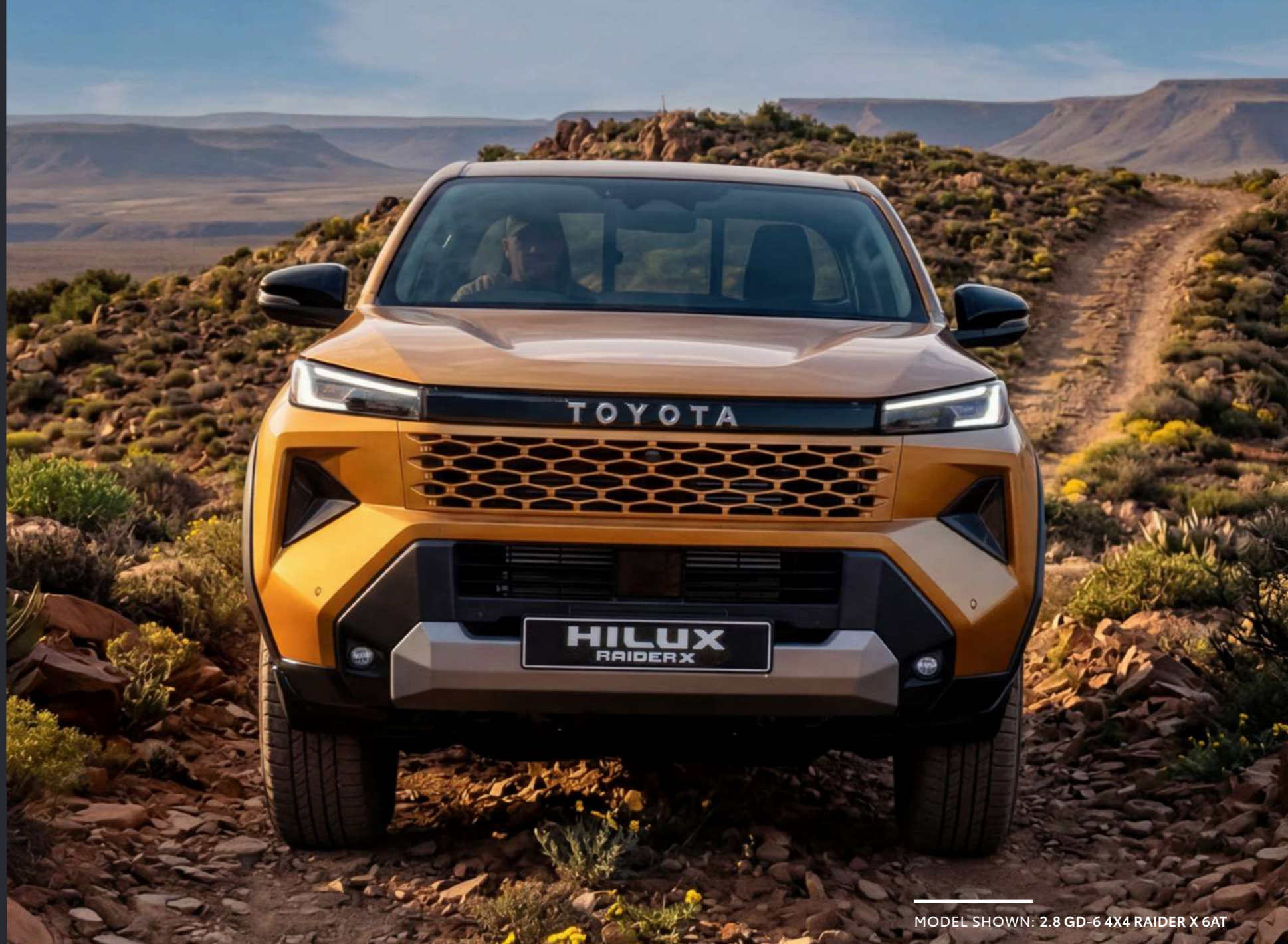
MODEL SHOWN: 2.8 GD-6 4X4 RAIDER X 6AT