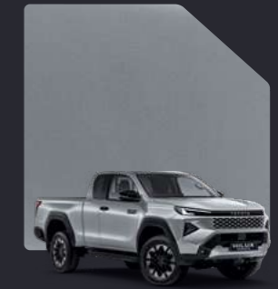
1D6 Chromium Silver