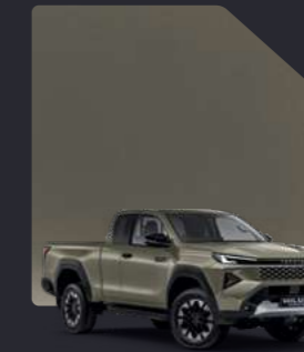
6X1 Oxide Bronze