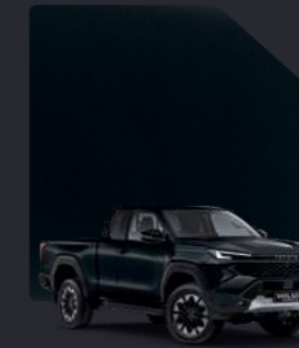
218 Attitude Black