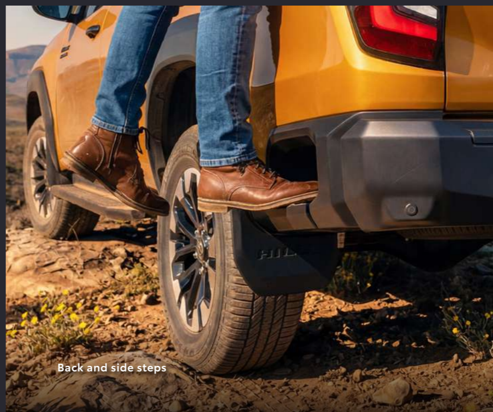
Back and side steps