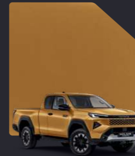
5C7 Desert Gold Metallic