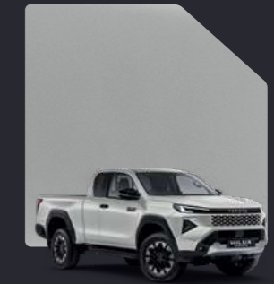
089 Platinum White Pearl