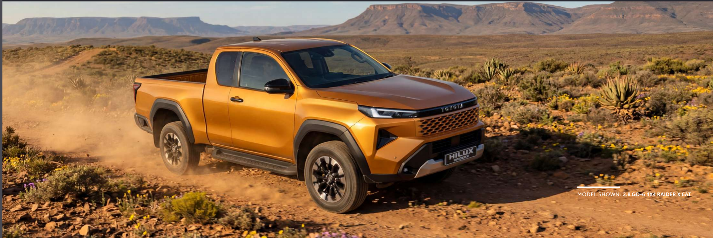
MODEL SHOWN: 2.8 GD-6 4X4 RAIDER X 6AT