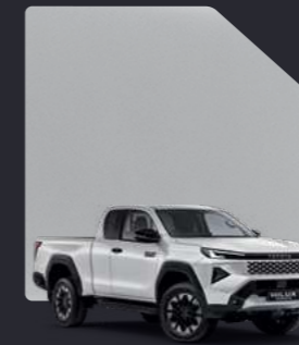
040 Glacier White