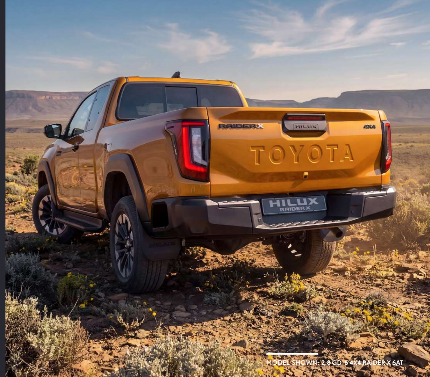
MODEL SHOWN: 2.8 GD-6 4x4 RAIDER X 6AT