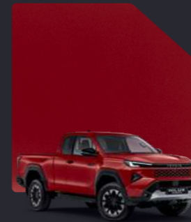
3T6 Arizona Red