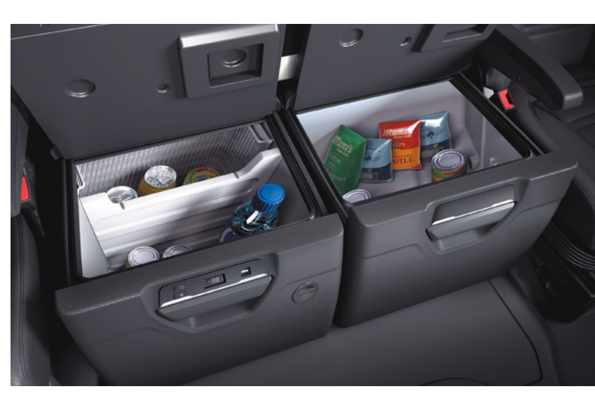
Two USB ports are located on the upper pockets Wide selection of refrigerators with capacities up to 100 litres and available with freezer.