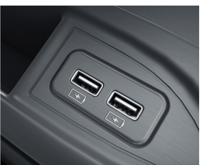
of each wall.