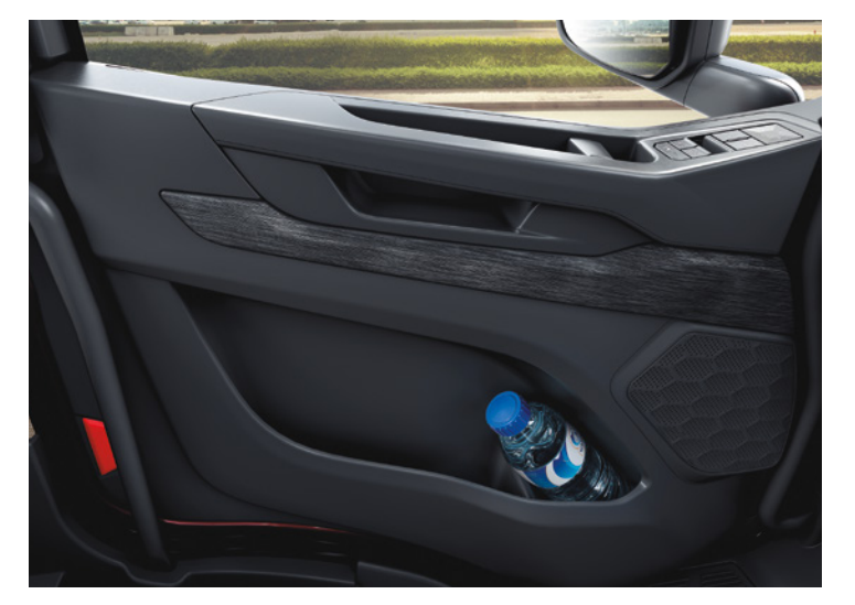
The new open glove compartment includes a 1.5-litre bottle holder. The lower console can contain a thick A4 folder.