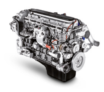
Cursor 13 NP