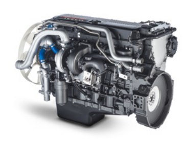
Cursor 9 Cursor 11