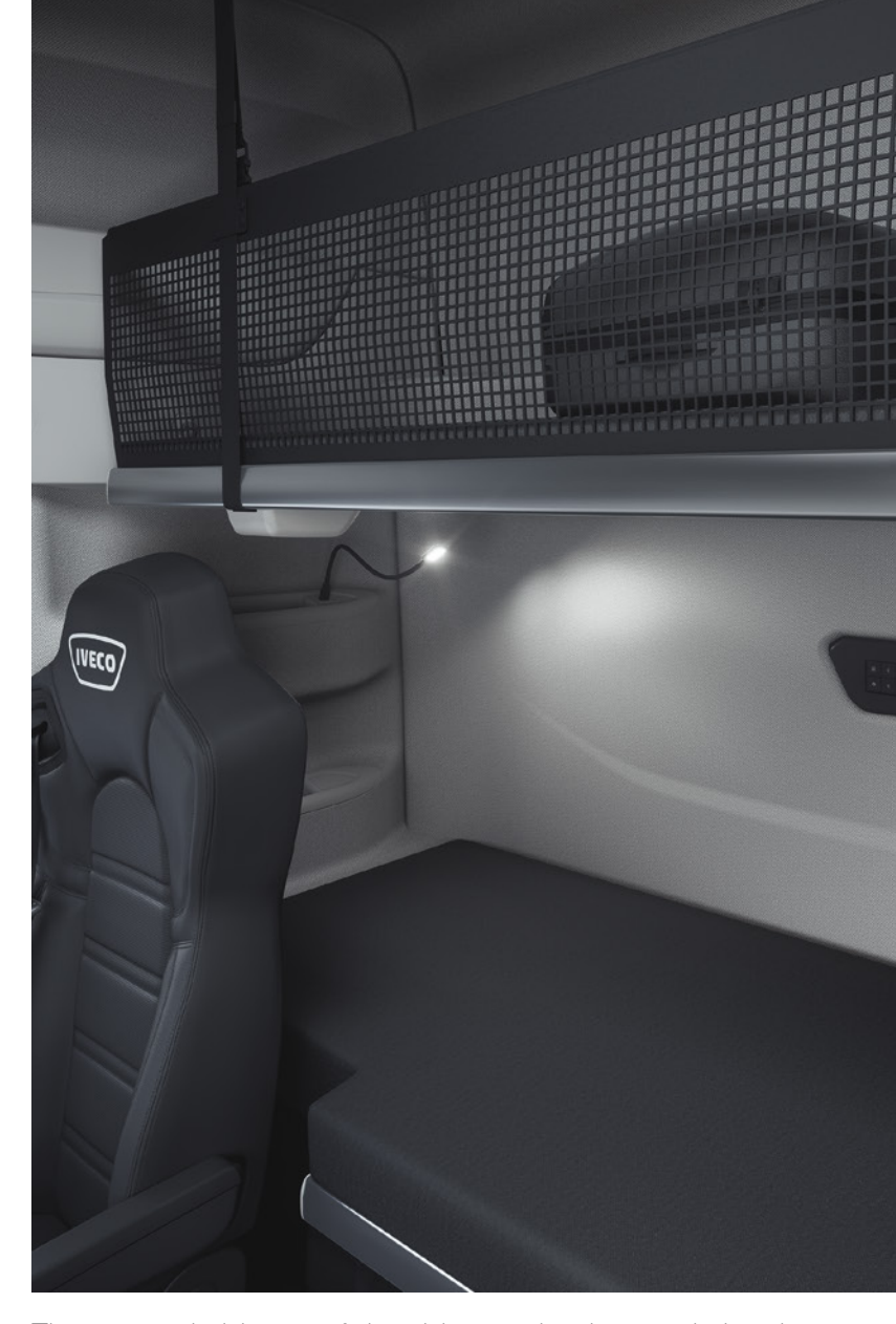
The symmetrical layout of the night area has been redesigned with the one-piece lower bunk – available with a choice of soft or hard mattress. You can also choose from the Smart or Comfort upper bunk, which can be used as a luggage compartment or a passenger bed.