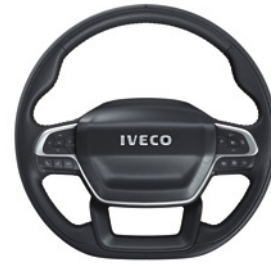
Choose the soft touch or leather steering wheel, both available in the classic shape or with the distinctive flat base.