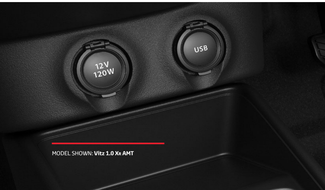
MODEL SHOWN: Vitz 1.0 XR AMT