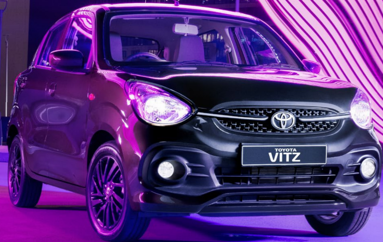
MODEL SHOWN: Vitz 1.0 Xr AMT

REINFORCING ITS OVERALL DRIVABILITY, IS THE 49KW, TWIN-INJECTION, THREE-CYLINDER ENGINE – ITS REAL SKILL LIES IN ITS ABILITY TO HARNESS ALL OF ITS 89NM OF TORQUE FROM A VERY ACCESSIBLE 3 500 REVS. IN NON-TECH SPEAK THIS MEANS YOU ACCELERATE MUCH QUICKER FROM THE TRAFFIC LIGHTS AND STIR THE GEARBOX A LOT LESS TO MAINTAIN MOMENTUM.