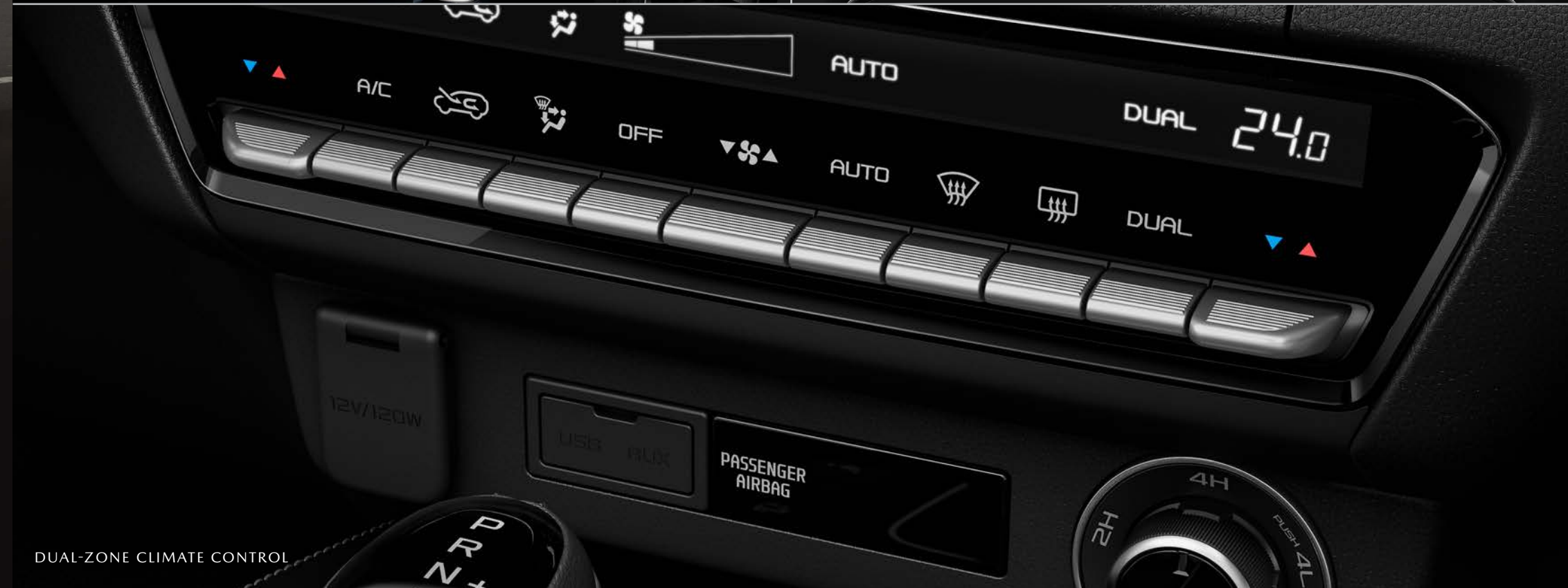
DUAL-ZONE CLIMATE CONTROL