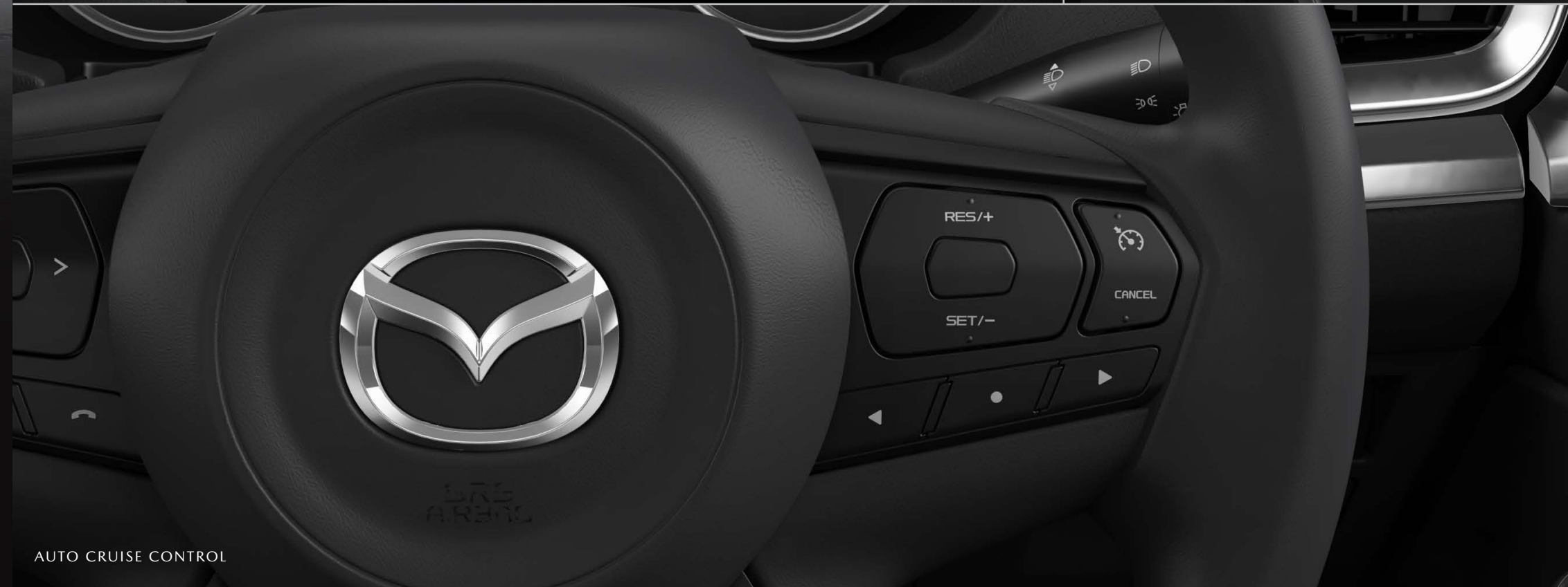
AUTO CRUISE CONTROL