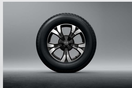
DYNAMIC & INDIVIDUAL MODELS 18" Dynamic and Individual Alloy wheels (Grey Metallic)