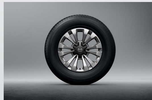
ACTIVE 17" Active Alloy wheels (Grey Metallic)