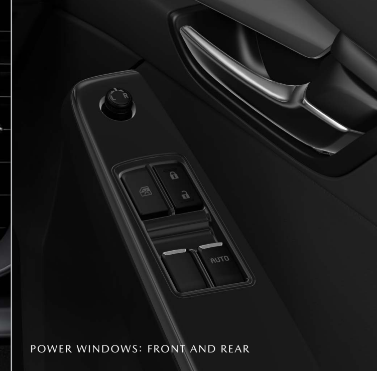
POWER WINDOWS: FRONT AND REAR