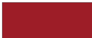
PULL ME OVER RED