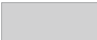
SWITCHBLADE SILVER METALLIC