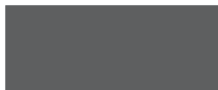
SON OF A GUN GRAY METALLIC