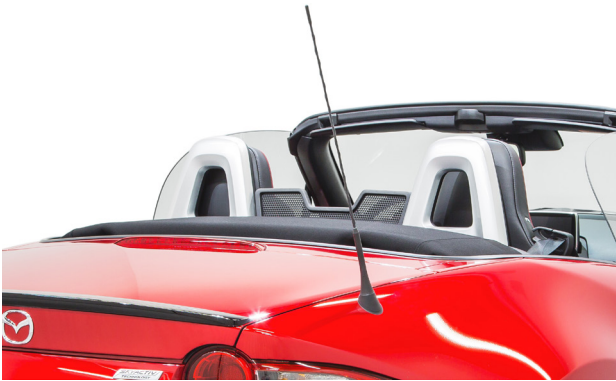
Silver Bar Covers & Gloss Black Boot Lid Lip