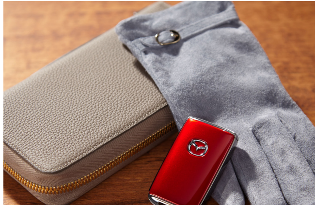
Key Cover (Various Colours)