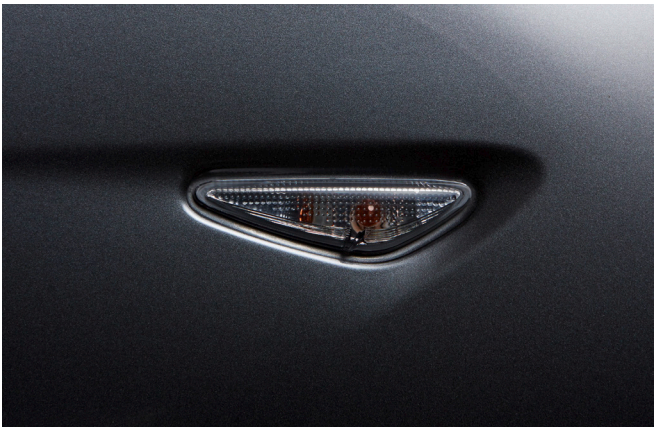
Shadowed Wing Indicator Lenses