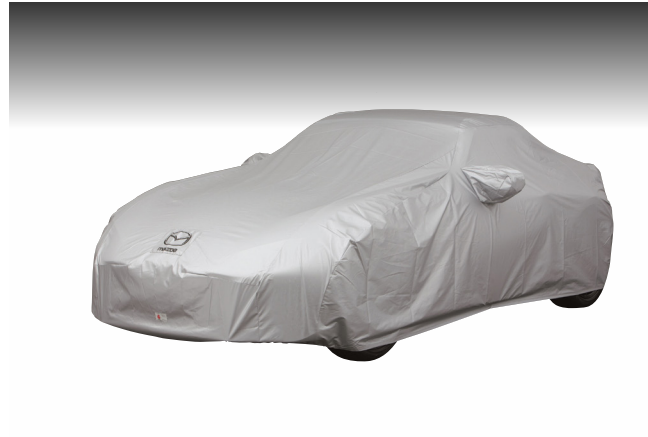
Tailored Full Vehicle Cover