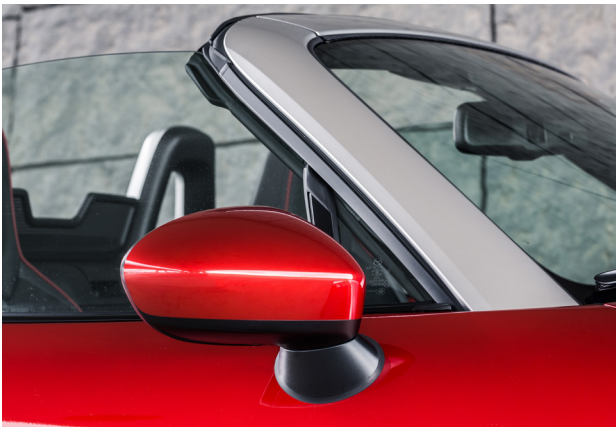
Silver Windscreen Surround