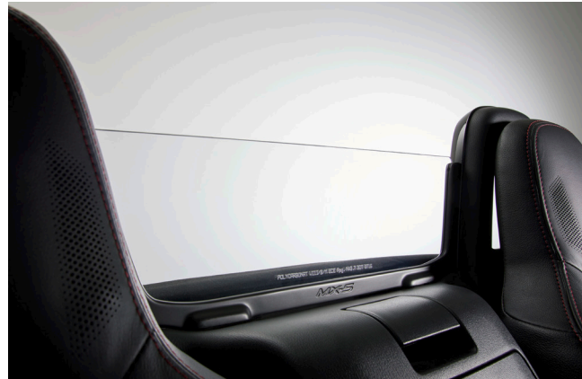
Wind Blocker - Clear*