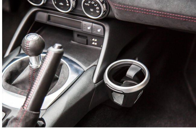
Silver Cup Holder Garnish

Mazda's Kodo design philosophy is evident across every aspect of the Mazda MX-5 right down to its alloy wheels or Bastuck Sports Exhaust which are designed to help express your own character, to create an even greater connection between you and your car.