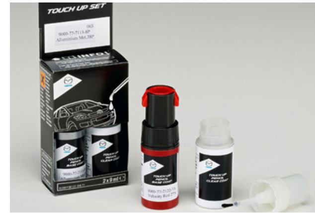
Touch Up Stick