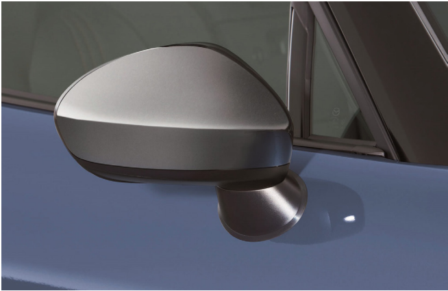
Silver Mirror Covers