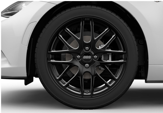
17" Glossy Black Alloy Wheel (Design 69)*