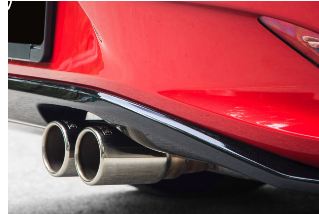
Bastuck Sports Exhaust