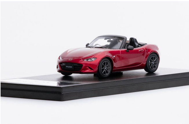
MX-5 Model Car