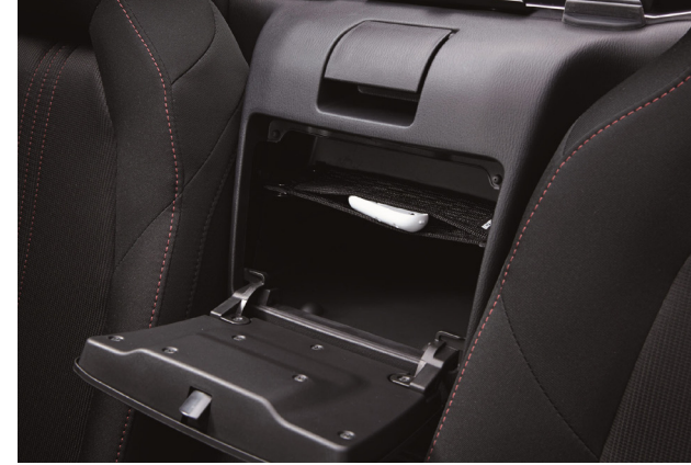
Centre Glovebox Shelf Net