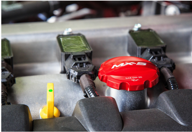
Red Aluminium Logo Oil Filler Cap