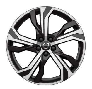
19" 5 Triple Spoke (#1236)