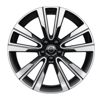
19" 5 double Spoke (#1068)