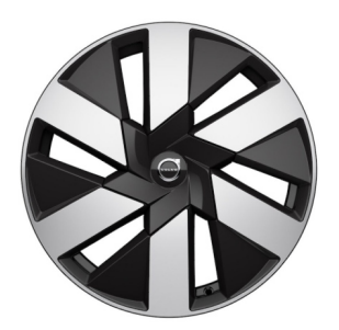
19" 6 Spoke (#1253)