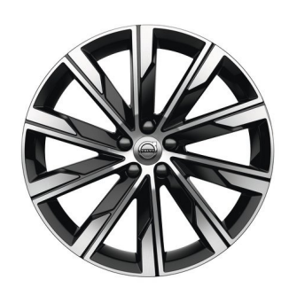
20" 10 Spoke Turbine (#800145)