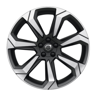
20" 7 Spoke (#800146)