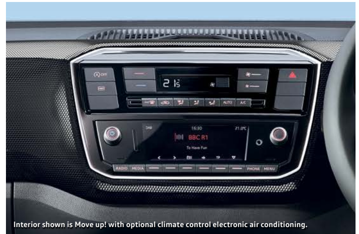
Interior shown is Move up! with optional climate control electronic air conditioning.