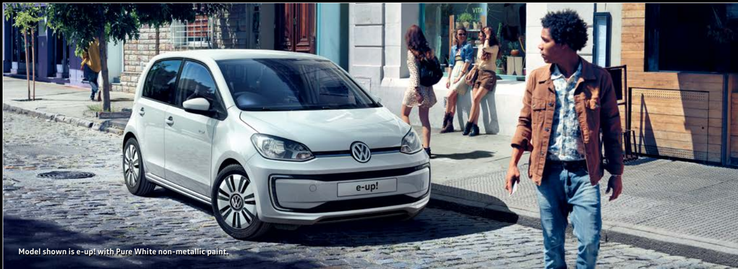
Model shown is e-up! with Pure White non-metallic paint.

6 The ABI insurance group is the recommended insurance rating set by the Association of British Insurers. Please note that insurance group ratings are purely advisory. They are used by insurers (ABI members and Lloyd's syndicates) as one of the factors in calculating premiums. Insurers are not required to follow the advisory group ratings and they may depart from them if they so wish.