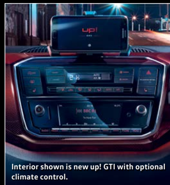
Interior shown is new up! GTI with optional climate control.

The specifications listed are for information purposes only as our products are continually updated and changes may be made to the specifications at any time. If you require any specific feature, please consult your authorised Volkswagen retailer who is regularly updated with any change in specification. Specifications are subject to change without notice. Models shown features optional Pure White non-metallic paint.