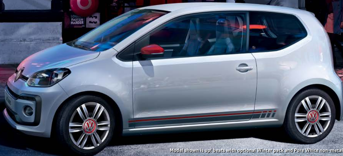
Model shown is up! beats with optional Winter pack and Pure White non-metallic paint.