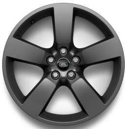
20" Style 5098, 5 spoke, Satin Dark Grey Standard on Defender X