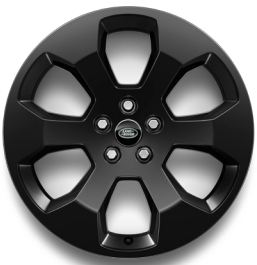
20" Style 6011, 6 spoke, Gloss Black