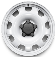
18" Style 5093, Gloss White, Steel Standard on Defender