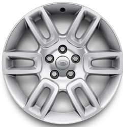
19" Style 6010, 6 spoke, Gloss Sparkle Silver Standard on Defender S