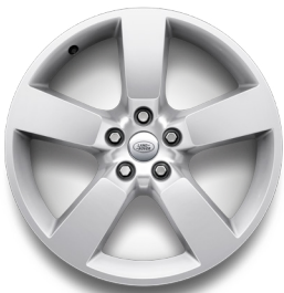
20" Style 5098, 5 spoke, Gloss Sparkle Silver Standard on Defender First Edition