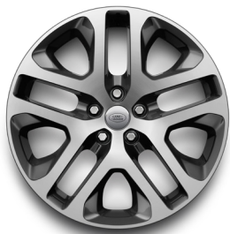
20" Style 5095, 5 split-spoke, Gloss Dark Grey with contrast Diamond Turned finish Standard on Defender HSE