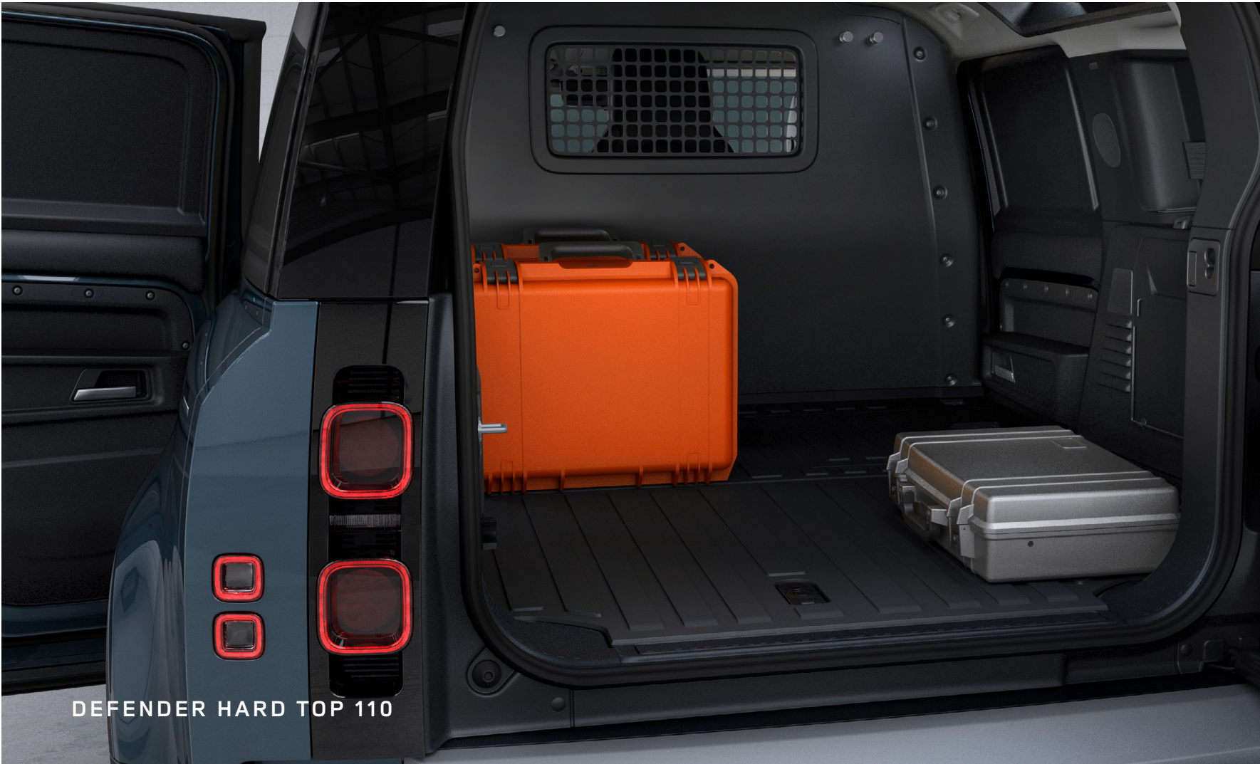
DEFENDER HARD TOP 110