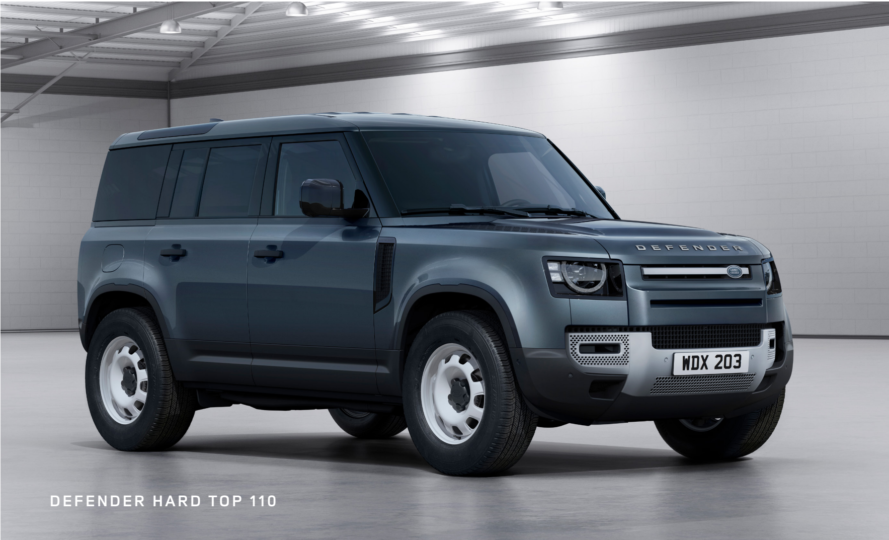
DEFENDER HARD TOP 110

Vehicle shown is Defender Hard Top 110 in Tasman Blue.