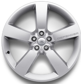
22" Style 5098, 5 spoke, Gloss Sparkle Silver