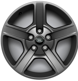
20" Style 5094, 5 spoke, Satin Dark Grey