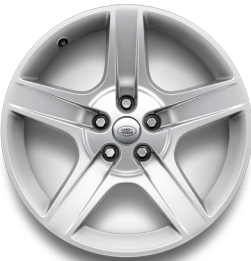
20" Style 5094, 5 spoke, Gloss Sparkle Silver Standard on Defender SE