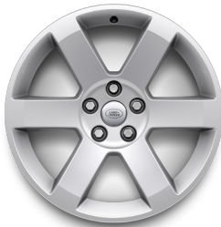
19" Style 6009, 6 spoke, Gloss Sparkle Silver (1) Standard on P400 Defender