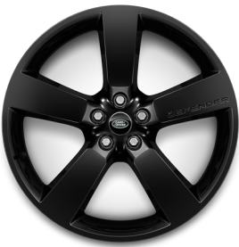
22" Style 5098, 5 spoke, Gloss Black