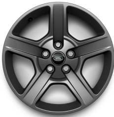
18" Style 5094, 5 spoke, Satin Dark Grey