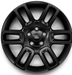
19" Style 6010, 6 spoke, Gloss Black