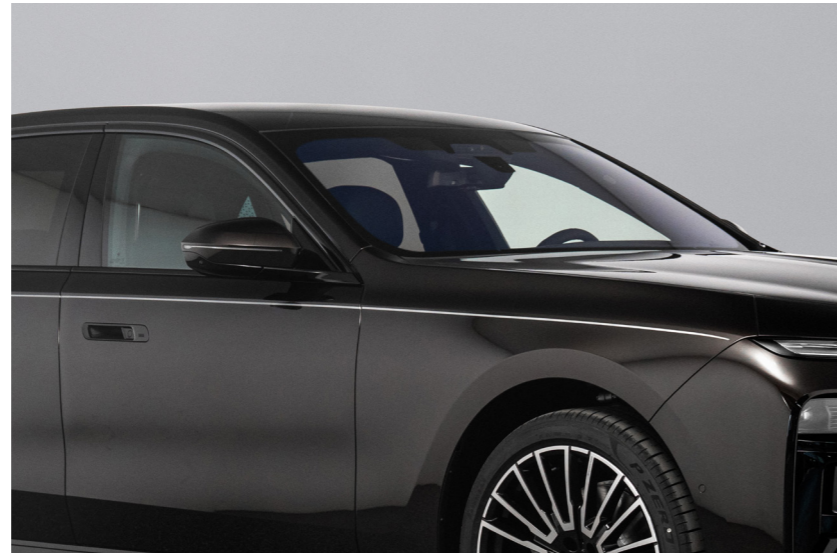
Coachline in Spacesilver.