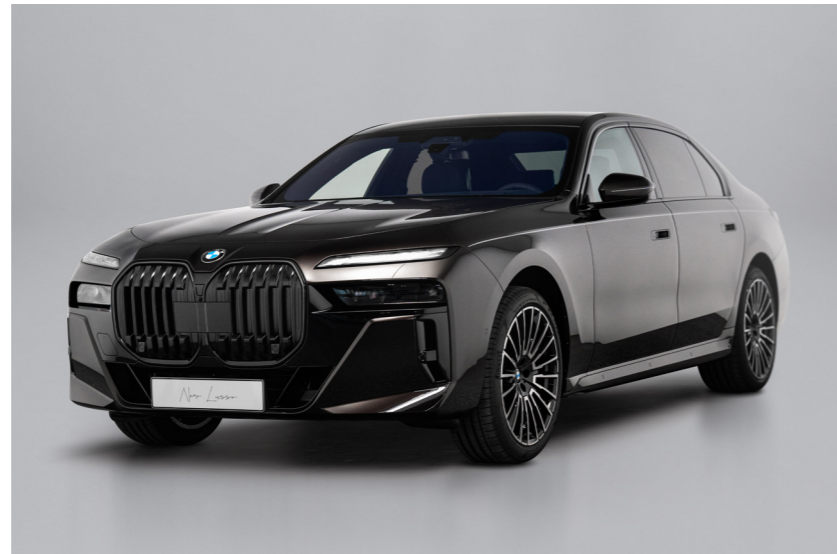
Exclusive Nero Fuoco Metallic exterior.

The Spacesilver coachline introduces a precise visual accent within this composition. It traces the silhouette and reinforces the vehicle's proportions, highlighting the interplay of surface and line. Set against the deep black finish, it enhances the perception of depth and form. A restrained yet defining detail that underscores the edition's distinctive character.