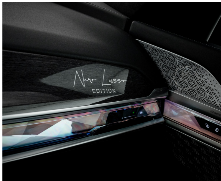
Interior trim featuring the Nero Lusso signature.