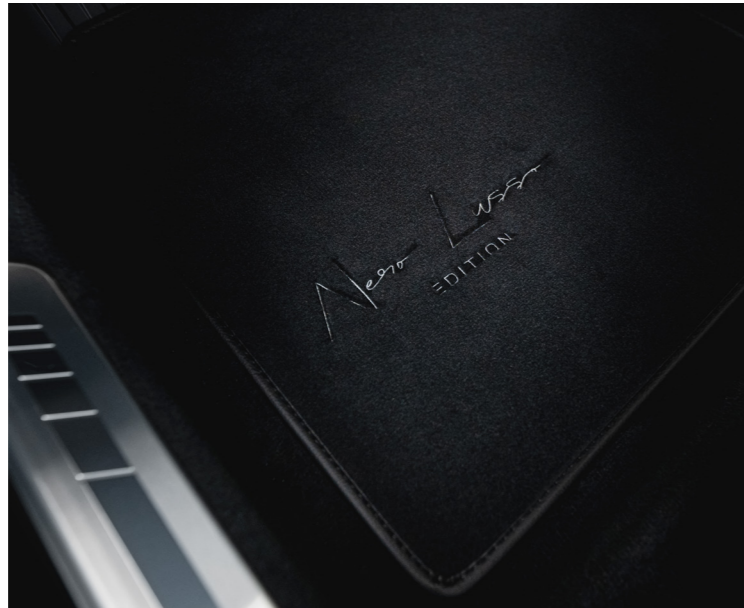
Floor mats with leather edging and contrast stitching.