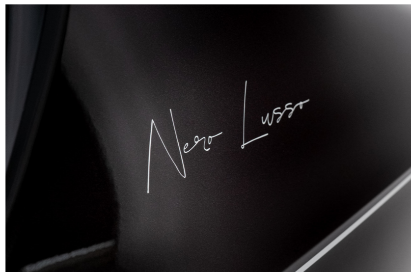
C-pillar with integrated edition logo.