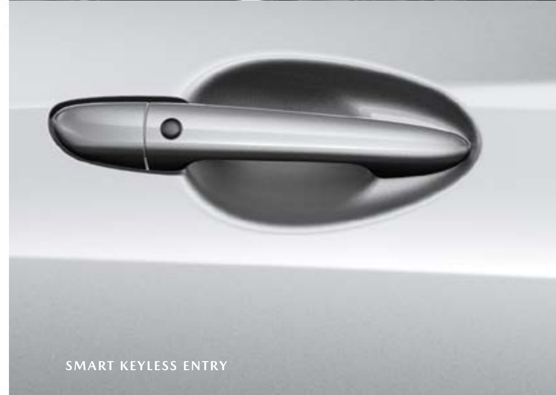
SMART KEYLESS ENTRY