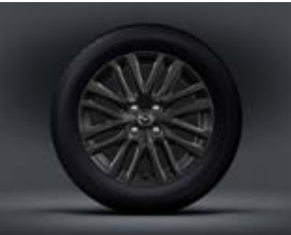
16" Alloy wheels (Black Metallic)