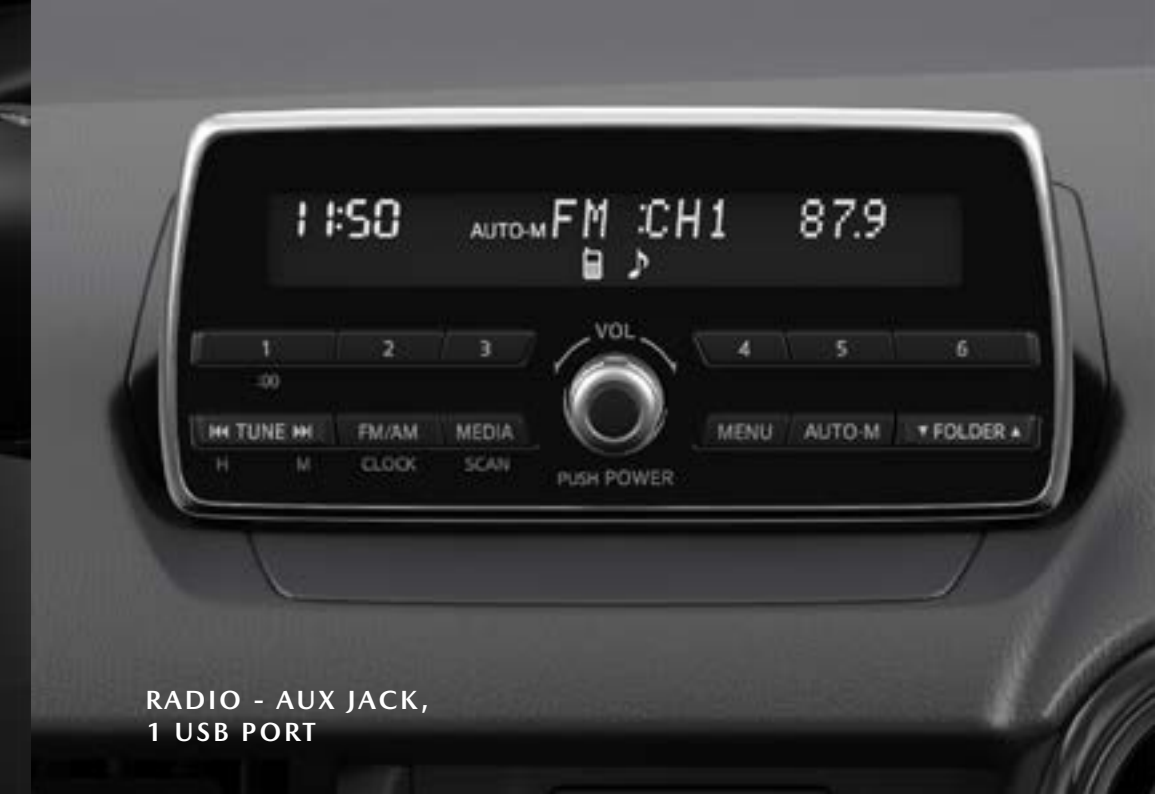
RADIO - AUX JACK, 1 USB PORT