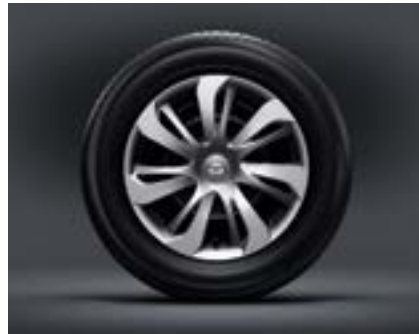
16" Alloy wheels (Steel Black)