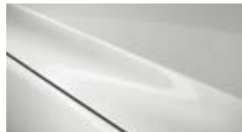
SNOWFLAKE WHITE PEARL