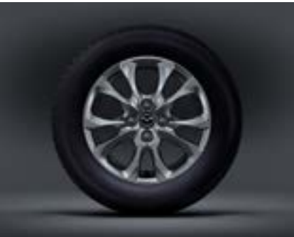
16" Alloy wheels (Silver Metallic)