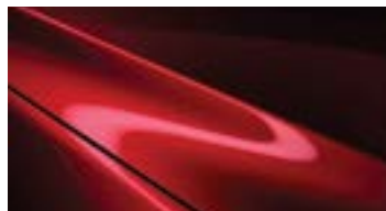
SOUL RED CRYSTAL