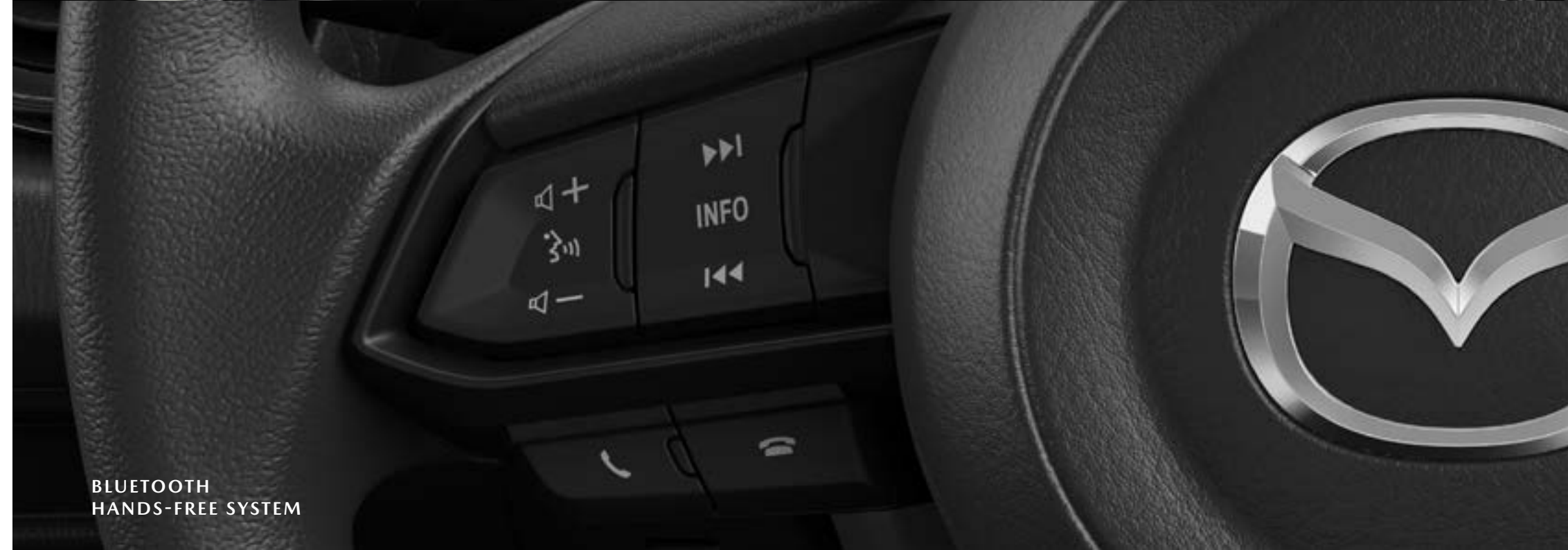
BLUETOOTH HANDS-FREE SYSTEM