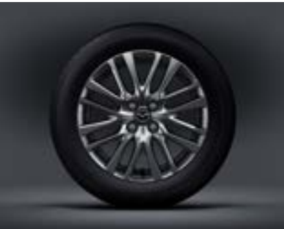
16" Alloy wheels (Bright)