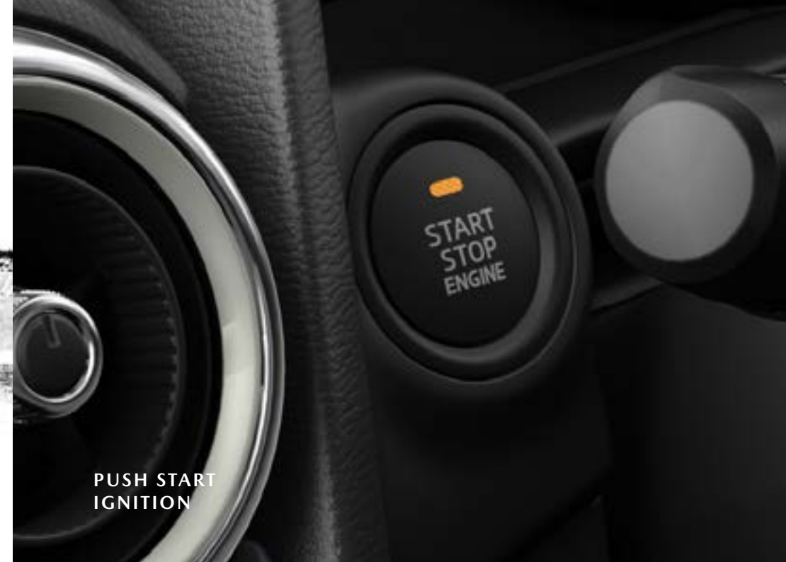
PUSH START IGNITION