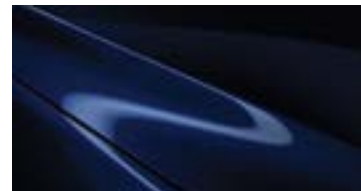
DEEP CRYSTAL BLUE