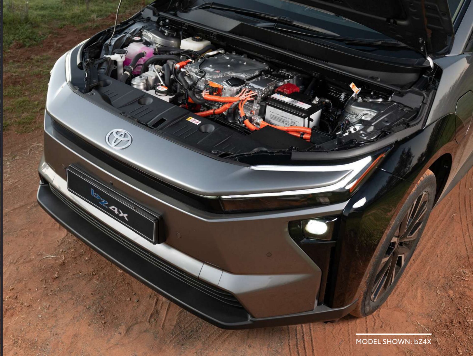
MODEL SHOWN: bZ4X