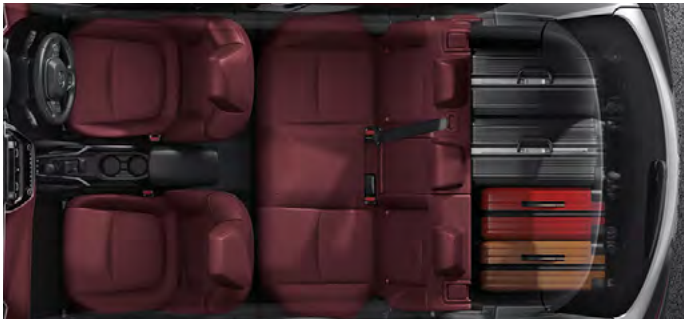
SPACIOUS AND ERGONOMIC CABIN

When conceptualising the Corolla Cross, designers imagined how occupants would actually use the vehicle. Throughout the process of creating the vehicle, marginal improvements were made to ensure maximum cabin space, while intricate levels of design and planning went into the ergonomics of the vehicle for a superior level of comfort.