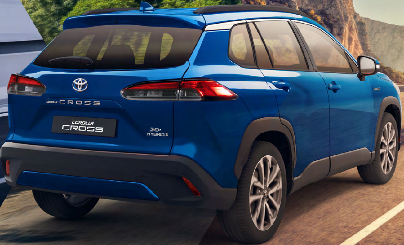
MODEL SHOWN COROLLA CROSS 1.8 XR CVT HYBRID

For complete driver control and passenger comfort, the all-new Corolla Cross is equipped with MacPherson strut front suspension; and a torsion beam at the rear for sure-footed handling and extra load-carrying ability.