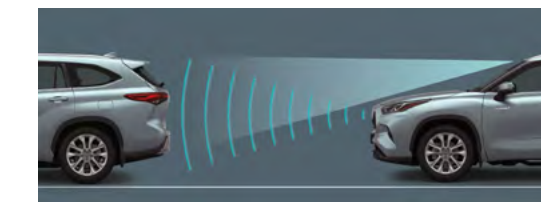
ADAPTIVE CRUISE CONTROL

Sensors serve to warn the driver of unseen objects parallel to, or behind the vehicle during lane changing as well as when reversing into perpendicular flowing traffic.