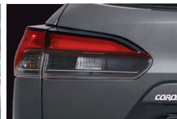
TRAPEZOIDAL LED TAIL LIGHTS