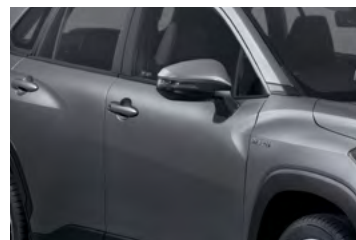
SLEEK ANGULAR LINES