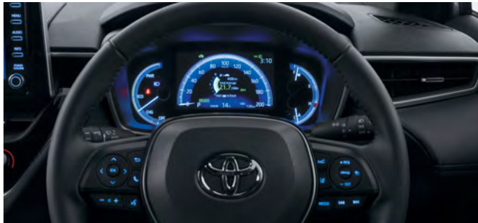
MULTI-FUNCTION STEERING WHEEL SWITCHES