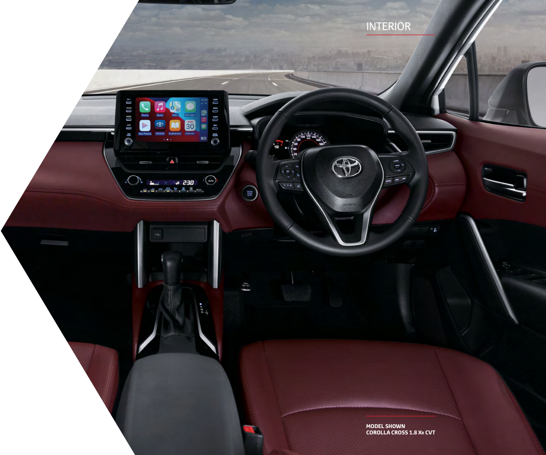
MODEL SHOWN COROLLA CROSS 1.8 Xr CVT