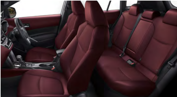
TERRA ROSA PARTIAL LEATHER* SEATS

THE SPACIOUS ALL-NEW COROLLA CROSS IS EQUIPPED WITH A RANGE OF LUXURY AND CONVENIENCE FEATURES THAT TURN DREAMS INTO REALITY.