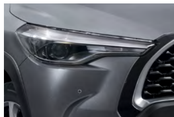
DISTINCTIVE LED* HEADLAMPS