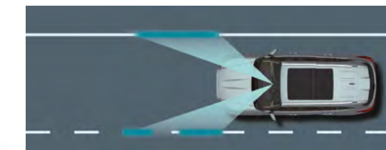
LANE KEEPING SYSTEM