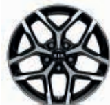
17" Alloy Wheels 225/45R17