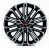
18" Alloy Wheels with Red Centre Cap 225/40R18