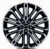
18" Alloy Wheels with Grey Centre Cap 225/40R18