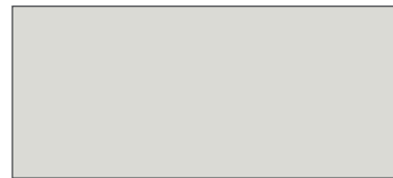
IRIDESCENT PEARL TRICOAT