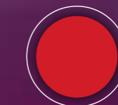
Burning Red Pearl Metallic

With 7 exciting colours to choose from, you're sure to find the Swift Attitude that's right for you.