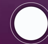
Pure White Pearl