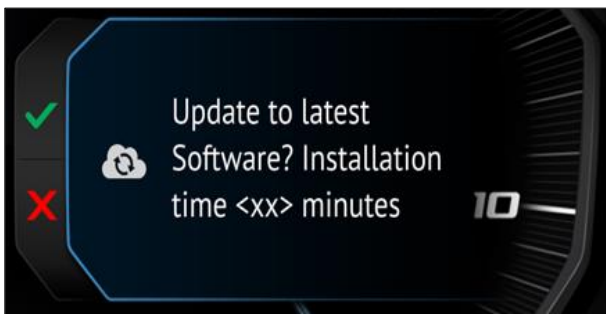
Figure 1 - Example of Display Panel Notice for Updates

This bulletin is released to advise the process of conducting Over the Air Updates (OTAs) where a vehicle display indicates that a software update is available. To ensure that the OTA software update is successful, please ensure that vehicle drivers/operators are aware of the process for installation.